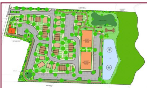
Edens Land is providing services to the new Nichols Village residential community in Durham, NC.