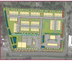
ATCS is providing numerous services in support of transforming the former Behnke's Nursery into a mixed-use development.