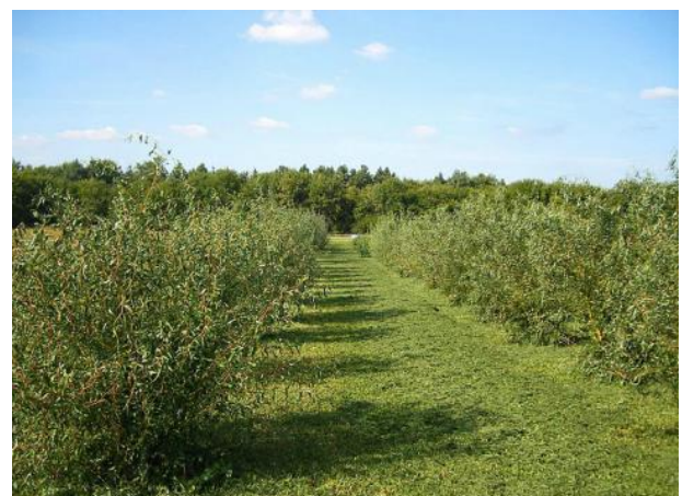
Figure 2. Woody florals can be grown in rows with 4 to 6 feet between plant and enough space for mowing equipment between rows.