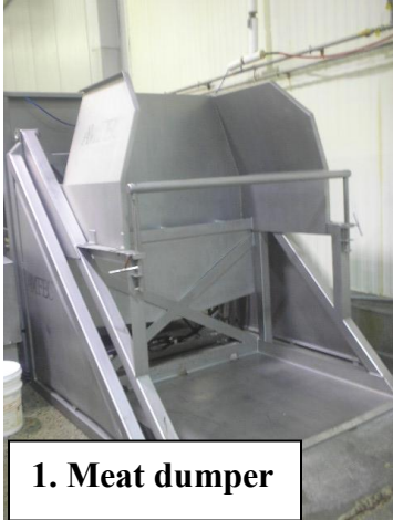
1. Meat dumper