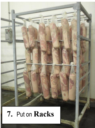
7. Put on Racks

6. Stuffing machine: to fill nets or cases