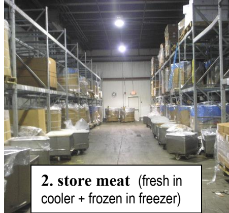
2. store meat (fresh in cooler + frozen in freezer)

3. Formula sheet + spice sheet There is a different formula + spice sheet for every product.