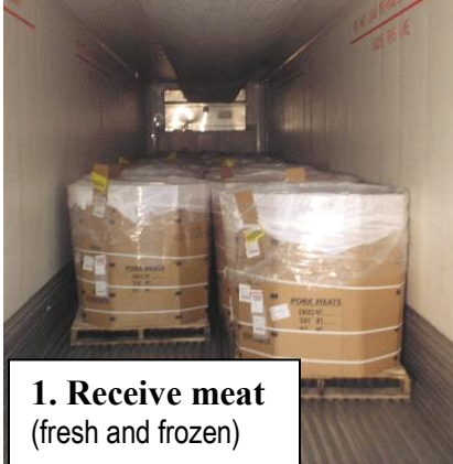
1. Receive meat (fresh and frozen)