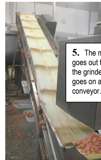
5. The meat goes out from the grinder and goes on a conveyor.