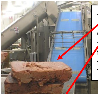
4. frozen meat goes on the conveyor + fresh meat though the dumper goes into frozen block Grinder . The grinder mixes the

3. Formula sheet + spice sheet There is a different formula + spice sheet for every product.