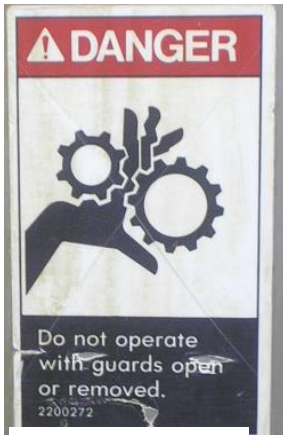
Sign as on CONVEYOR