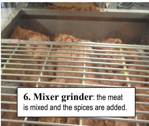
6. Mixer grinder: the meat is mixed and the spices are added.