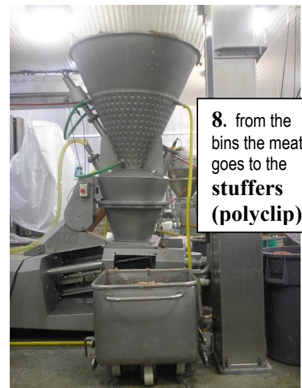
8. from the bins the meat goes to the stuffers (polyclip)