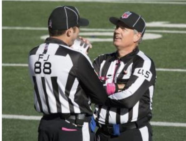
Figure 13.3: Striking referees were temporarily replaced by management (the NFL) during a strike in 2012

Another management tactic is replacing striking workers with strikebreakers —non-union workers who are willing to cross picket lines to replace strikers. Though the law prohibits companies from permanently replacing striking workers, it's often possible for a company to get a court injunction that allows it to bring in replacement workers. For example, the NFL employed replacement referees in 2012, a move which led to a number of very questionable calls on the field. 8