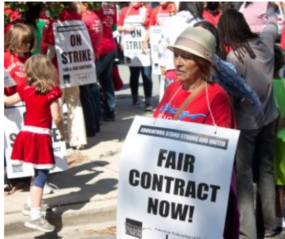
Figure 13.2: Chicago teachers picketing during a strike in 2012

The final tactic available to unions is boycotting , in which union workers refuse to buy a company's products and try to get other people to follow suit. The tactic is often used by the AFL-CIO, which maintains a national "Don't Buy or Patronize" boycott list. In 2003, for example, at the request of two affiliates, the Actor's Equity Association and the American Federation of Musicians, the AFL-CIO added the road show of the Broadway musical Miss Saigon to the list. Why? The unions objected to the use of non-union performers who worked for particularly low wages and to the use of a "virtual orchestra," an electronic apparatus that can replace a live orchestra with software-generated orchestral accompaniment. 6