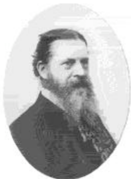
Charles Sanders Peirce (1839-1914)

Sponsors of the conference: The Virginia Tech Humanities Symposium Award, the Office of the Provost, the College of Liberal Arts, the Philosophy Department, STS, College of Architecture.