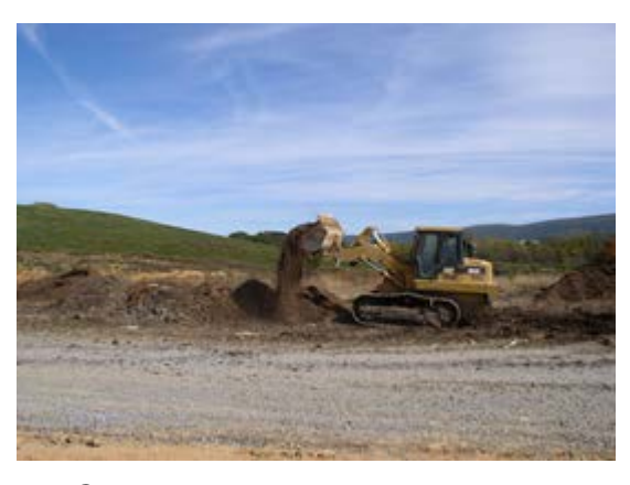
Composting Mortality at the Shenandoah County Landfill

Some county landfills accept animal mortality from farms in their locality. Landfills will either bury or compost the animal mortality. Availability, price and drop-off times will vary by county, so contact your local landfill or Extension Office for more information.