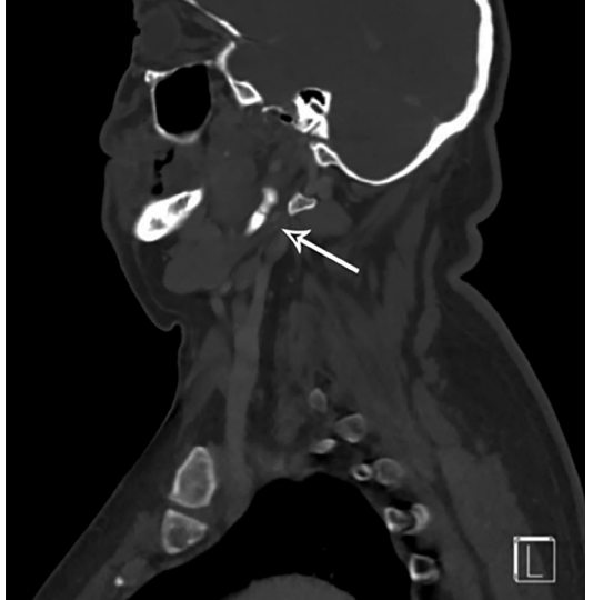
Image 1. Computed tomography of the neck with intravenous contrast in sagittal view showing an elongated left styloid process with associated atraumatic fracture, indicated by arrow.

This report highlights an important differential in the workup of painful neck swelling that has the potential to lead to life-threatening complications if not promptly recognized.