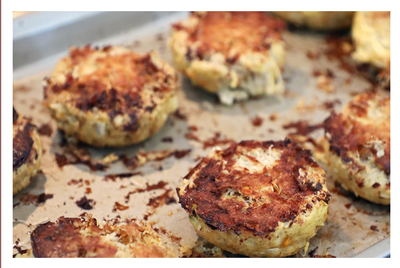
Figure 7. Crab cakes.

products that are served hot to the public to at least 165 °F. Once the food reaches that temperature, keep it at 135 °F or greater until sold (fig. 8a). If serving cold, keep seafood products at 41 °F or lower (fig. 8b). Use a calibrated metal stem thermometer to ensure you meet these required temperatures.