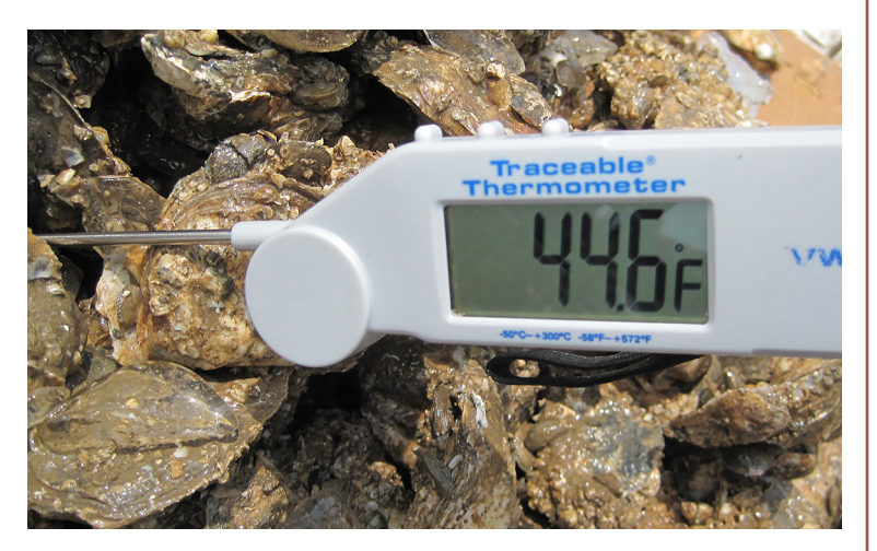
Figure 6. Keep live oysters at 45 °F or below.

Keep live oysters, clams, and mussels cold (45°F or less; fig. 6) during transport and display at the market either by the use of refrigeration and/or ice. Keep in mind that this is a live product and quality may be affected if kept too cold. Make sure that the bags or boxes of oysters remain intact with their harvest tags. Do not mix batches or sources of oysters.