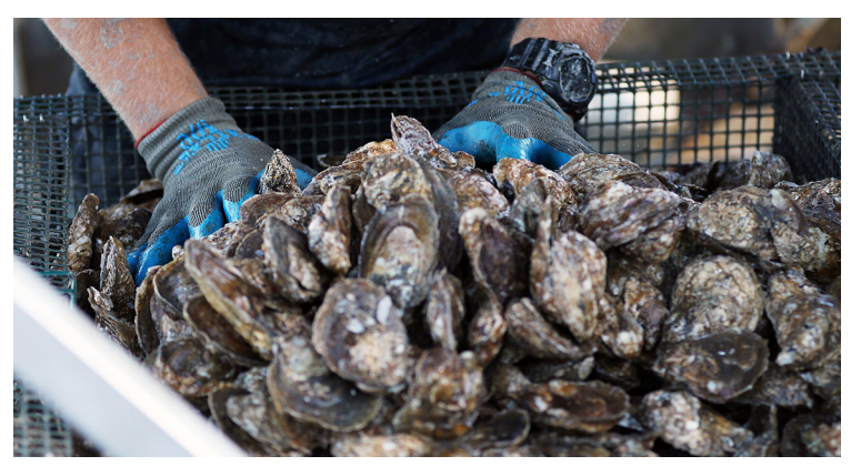
Figure 5. Virginia oysters.