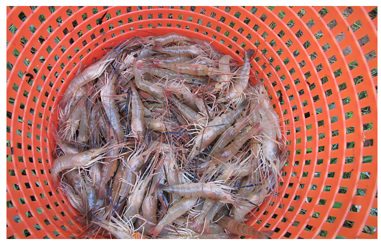
Figure 1b. Shrimp from Virginia aquaculture.