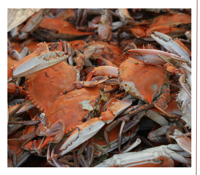
Figure 1a. Cooked blue crabs.

Virginia is the largest seafood producer on the Atlantic Coast. Customers have access to a variety of fresh and local seafood, including oysters, sea scallops, clams, blue crabs, striped bass, flounder, croaker, and black sea bass, among many others. Selling at farmers markets provides another opportunity to make Virginia's fresh seafood accessible to more clients and helps to sustain Virginia's economy (figs. 1a, 1b, 1c, 1d).