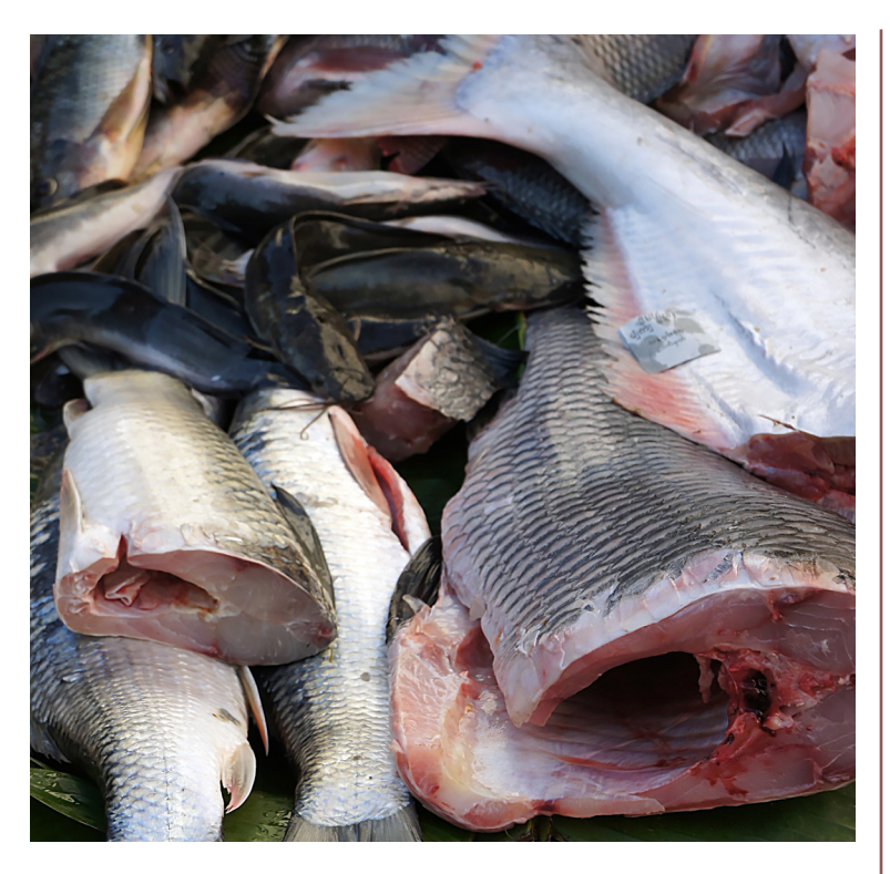
Figure 1d. Dressed fish.