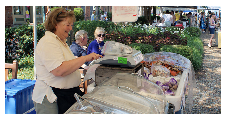
Figure 3. A vendor sells seafood at a farmers market.

* Make sure you have an adequate amount of ice or other means to sustain a cold temperature during your entire stay at the farmers market (fig. 3). Constant opening and closing of coolers or other cooling equipment will cause the ice to melt. Drain and replace melted ice from the coolers to make sure product is not submerged in water, potentially contaminating it. Use a thermometer to verify that food is being maintained at or below 41°F.