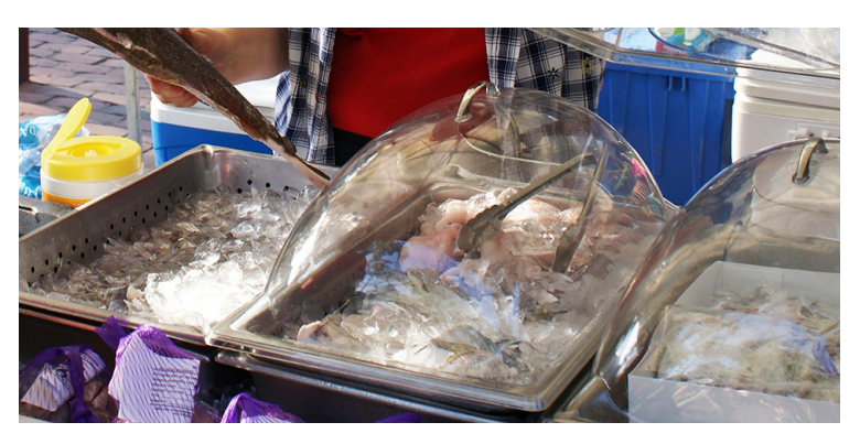
Figure 4. Seafood products displayed on ice and covered.

During display, bury packaged products such as crabmeat and shucked oysters in ice rather than keeping them on top of ice.