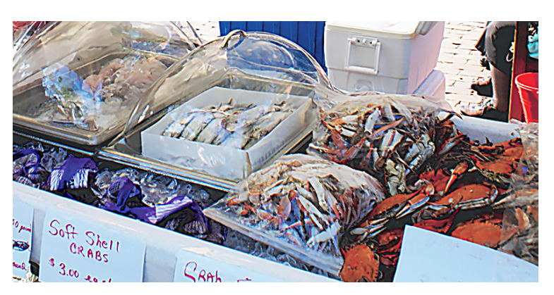
Figure 2. Covered seafood displayed on ice. Signs provide information to customers

Note: All seafoods offered for sale at a farmers market require a facility inspection by VDACS and must come from an approved source.