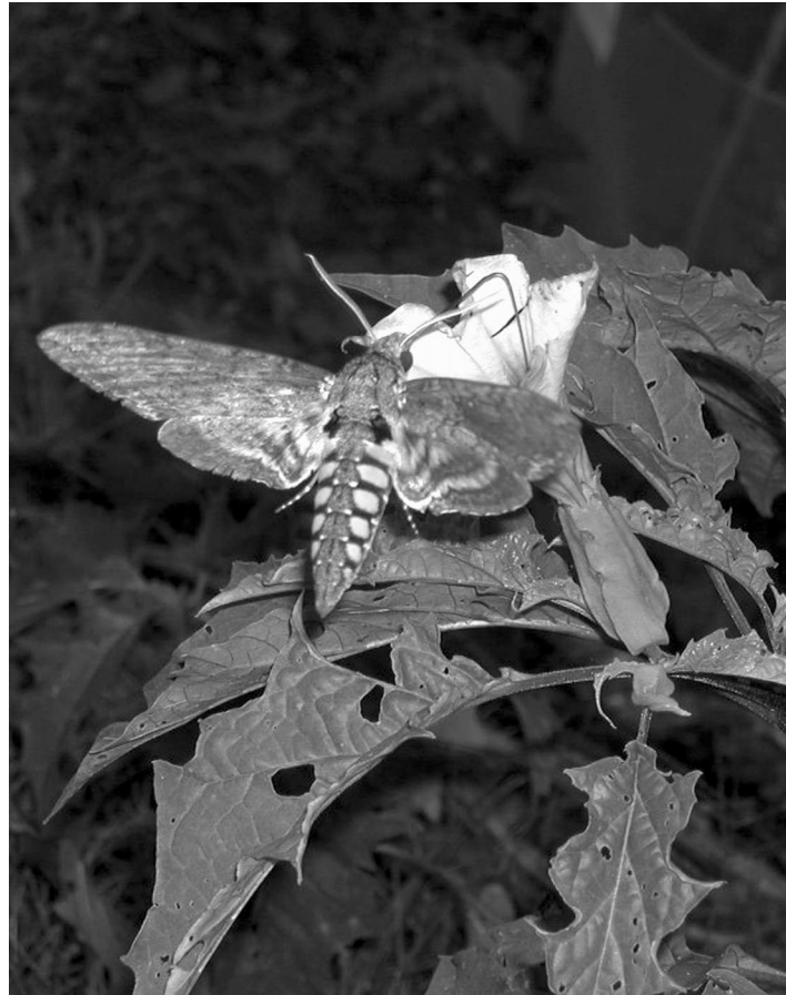
PLATE 1. An adult Manduca sexta feeding at a Datura stramonium flower. Larval M. sexta are specialist herbivores on D. stramonium and related plants in the Solanaceae.

larvae does not create an explicit trade-off for plants in terms of both attracting and deterring the same species, but may still result in conflicting selection on nectar production from these species and the legitimate pollinators.