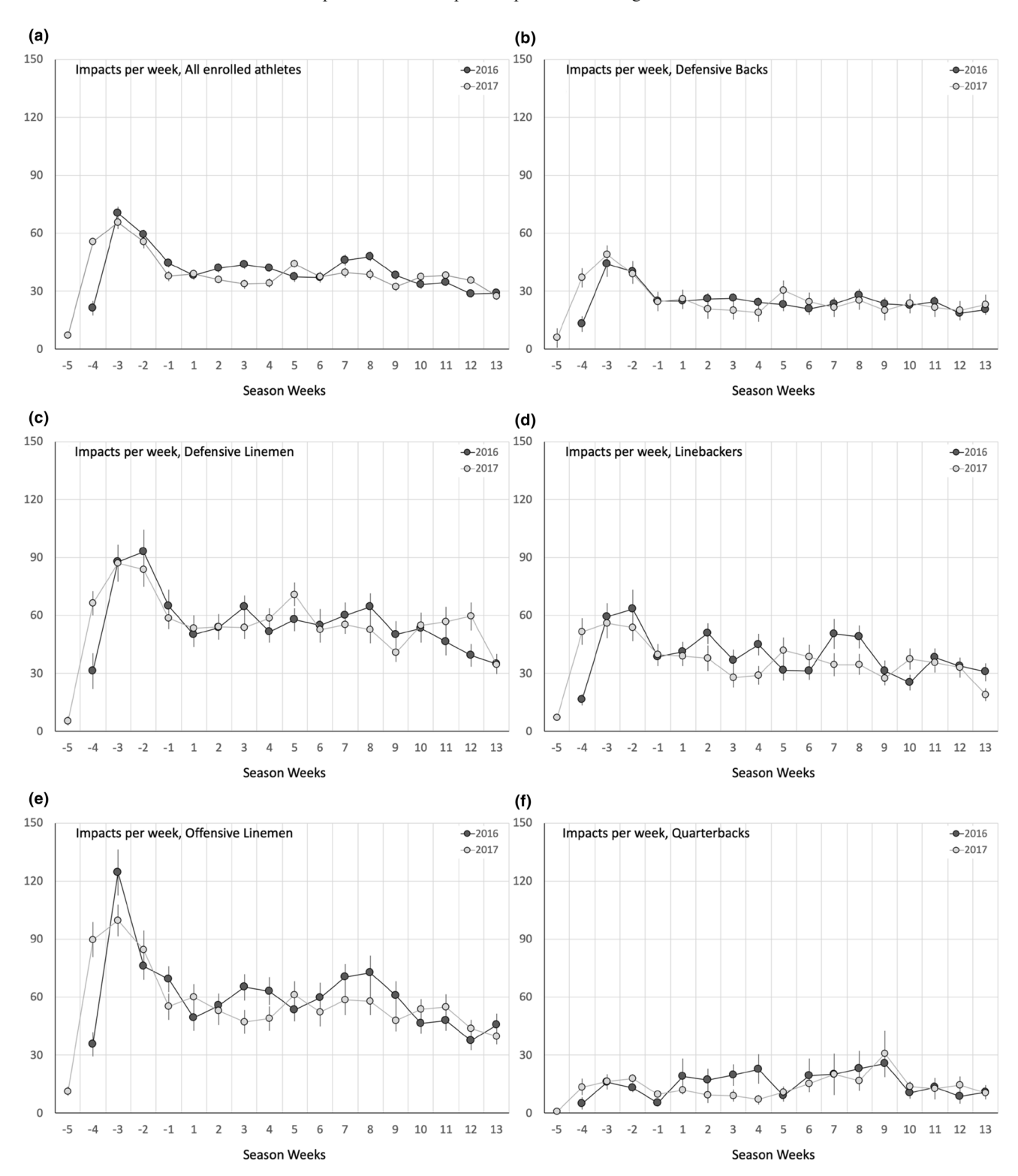
FIGURE 1. Average number or recorded head impacts per week for each of the eight position groups analyzed in this study. Dark lines/dots represent data from 2016 and light lines/dots represent data from 2017. Position groups include (b) defensive backs, (c) defensive linemen, (d) linebackers, (e) offensive linemen, (f) quarterbacks, (g) running backs, (h) tight ends, and (i) wide receivers. Overall position-independent data (a) are also presented.