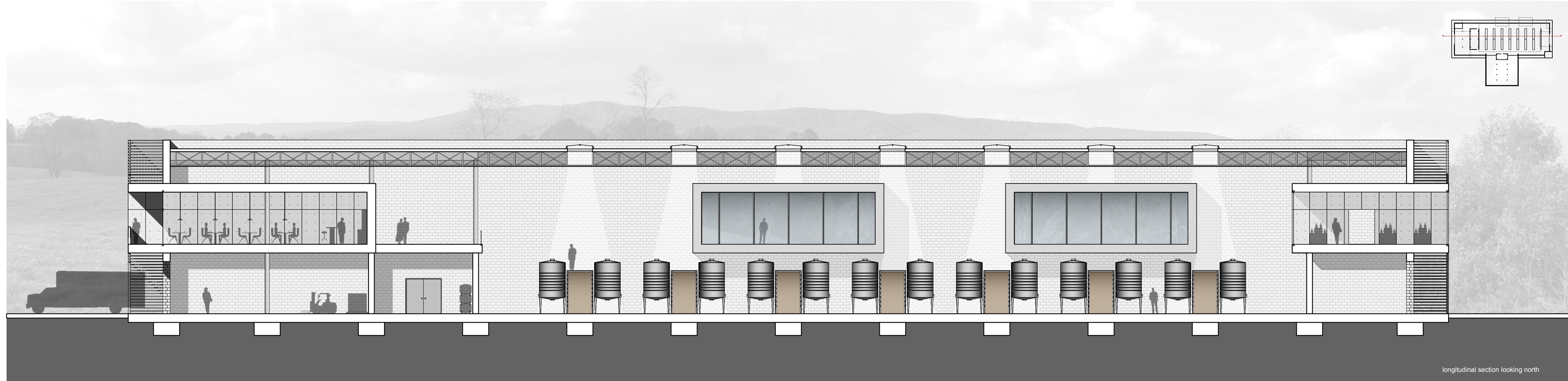
longitudinal section looking north