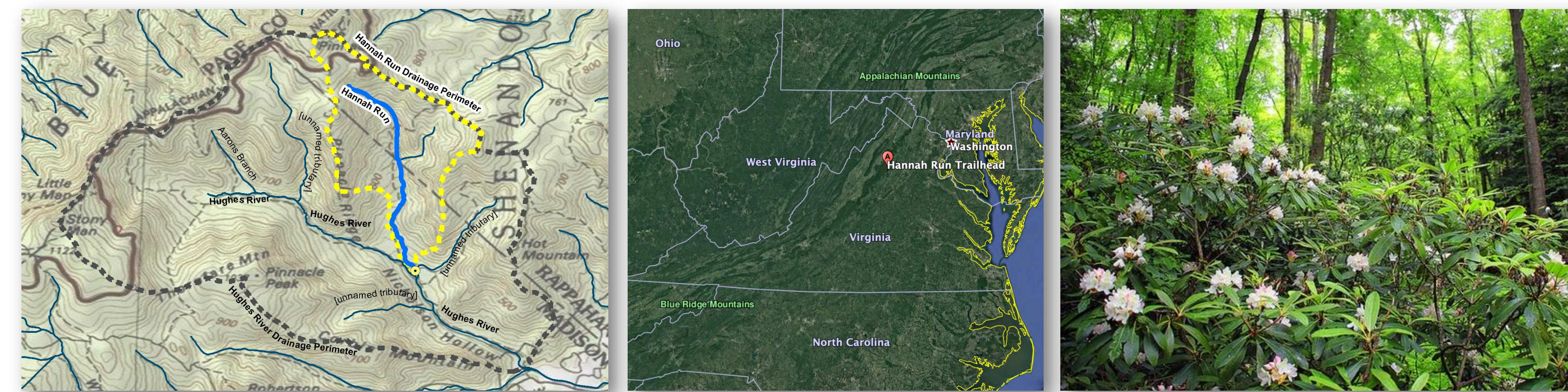
Figure 1—Hannah Run (blue; left) in Shenandoah National Park (38.600574, -78.316456) and R. maximum (right).