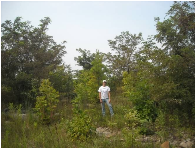
Figure 6. The same mine site as Figure 4, with weathered brown sandstone, six years after planting with native hardwood trees. Good growth by trees and herbaceous plants is evident.