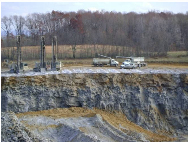
Figure 3. In the background is the native plant community growing on native soils. In the foreground, the native soil has been stripped off of the surface. The overburden consists of the weathered brown sandstone over unweathered gray sandstone and siltstone.

While unweathered gray rock materials brought to the surface during mining will eventually weather into soils, they are generally not suitable for restoring pre-mining forest capability. Forest development can be accelerated by using the natural soil and/or weathered brown rock materials to reconstruct the land surface (Figure 3). Salvaged soils and weathered rocks are superior to unweathered gray rocks as soil substitutes because of their superior ability to supply nutrients, air, and water to plants (Figures 4-7). Hardwood trees and other plants that are native to Appalachian landscapes have evolved to grow in the region's soils and near-surface weathered rocks (Smith, 1983; Torbert and Burger, 2000).