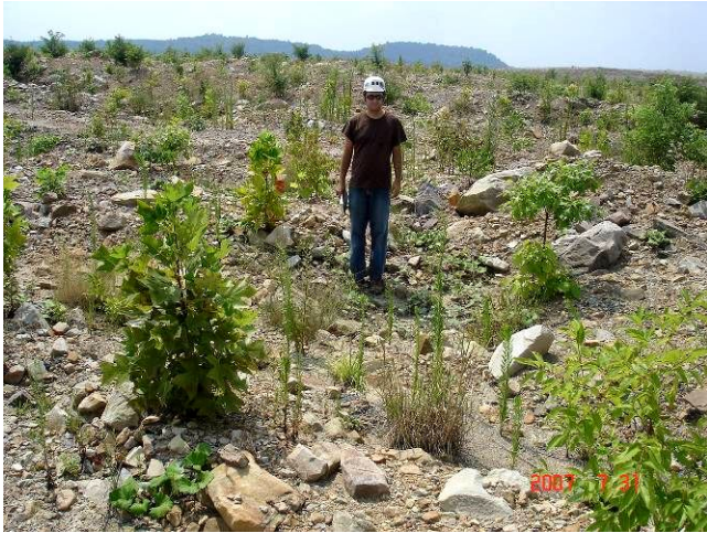
Figure 4. Weathered brown sandstone on a West Virginia mine site has formed a mine soil that supports good tree growth and has good colonization of native plants after two years. Mine soil pH is 6.0. The experimental areas on this mine site were not seeded with ground cover.