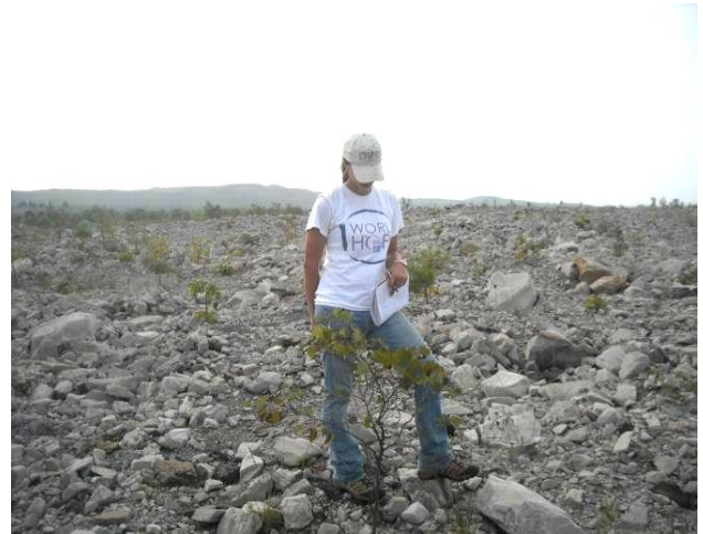
Figure 7. The same mine site as Figure 5, with unweathered gray sandstone, six years after planting with native hardwood trees. Although planted trees are surviving, growth is poor. Soil pH remains above 7.5.

First, viable seeds and propagules contained in the soil (called a seed bank ) enable restoration of native forest species (Hall and others, 2010). Second, organic matter in the native soil contains nitrogen and phosphorus, soil nutrients essential for plant growth that are not readily available to plants growing in unweathered mine spoils. Third, soil-dwelling animals and microorganisms in the forest soil aid in providing and cycling nutrients for plants, create channels for air and water movement, and promote favorable hydrologic properties.