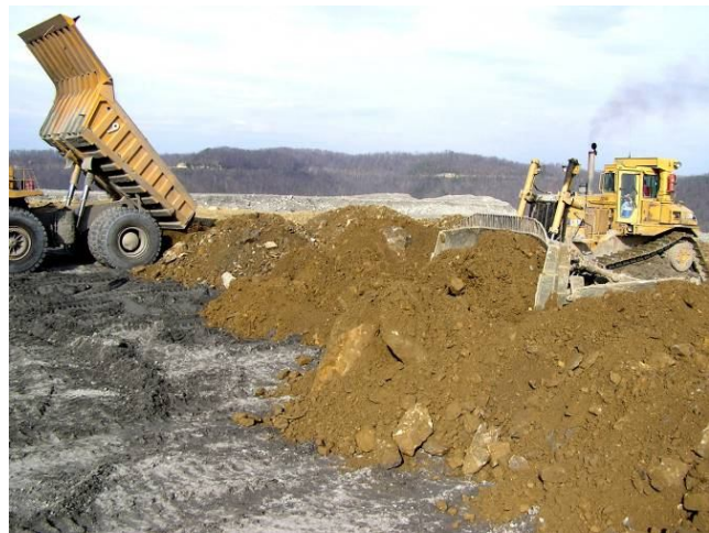
Figure 8. Mixing of soil materials can be accomplished by transporting them to the site, dumping them in adjacent piles, and then lightly grading the materials.

When both salvaged native soils and other materials are being used for mine soil construction, "mixing" is accomplished by hauling and dumping materials, and then by lightly grading the surface (Figure 8) or with the use of other equipment to level the surface (Figure 9) (FRA Advisory #3, Sweigard and others, 2007). It is essential that spreading be done in a manner that avoids soil compaction. Additional equipment operation to mix these materials more thoroughly should be avoided to reduce the potential for compaction of the surface layers.