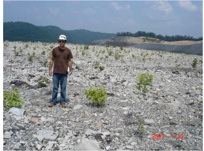
Figure 5. Unweathered gray sandstone on the same West Virginia mine site as in Figure 4 after two years shows some weathering into smaller particles, but has shown generally poor tree growth and poor colonization by native plants. The pH is above 8.0.