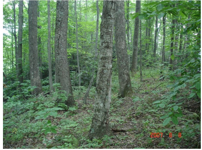
Figure 2. The native soils of Appalachia (left) develop over long time periods and have properties that are well suited to supporting native forest ecosystems (right).

While unweathered gray rock materials brought to the surface during mining will eventually weather into soils, they are generally not suitable for restoring pre-mining forest capability. Forest development can be accelerated by using the natural soil and/or weathered brown rock materials to reconstruct the land surface (Figure 3). Salvaged soils and weathered rocks are superior to unweathered gray rocks as soil substitutes because of their superior ability to supply nutrients, air, and water to plants (Figures 4-7). Hardwood trees and other plants that are native to Appalachian landscapes have evolved to grow in the region's soils and near-surface weathered rocks (Smith, 1983; Torbert and Burger, 2000).