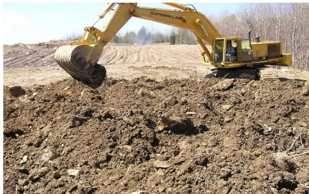
Figure 9. An excavator can be used to level dumped topsoil piles without causing compaction and can be quite useful when the dumped soil piles contain stumps, logs and other coarse woody debris.

Some weathered sandstones are low in essential plant nutrients, and mixing these materials with weathered siltstone or shale may improve soil fertility (Showalter and others, 2010). Soil tests can predict available nutrient levels in these materials.