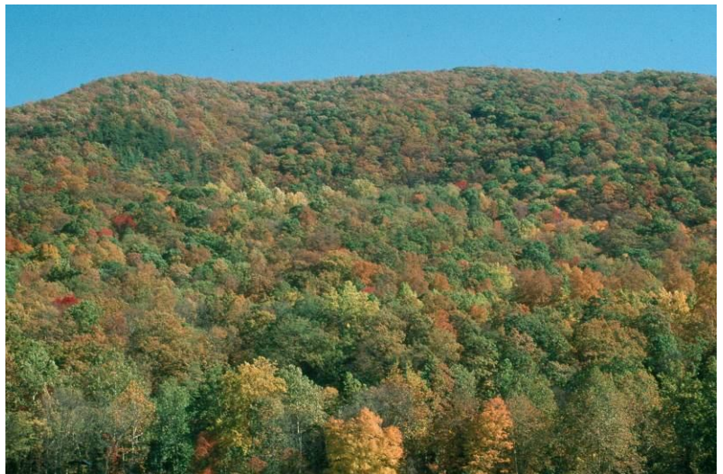
Figure 1. The Mixed Mesophytic Forest of the Appalachian mountains is a diverse assemblage of over 40 tree species that depend on native soil properties and other environmental factors

Weathering is the process of changing rocks into soil-like materials. During surface mining, unweathered rocks are often placed on the surface as growth media. These rocks react with air and water and break down physically and chemically, releasing soluble salts and changing mineral forms (Sencindiver and Ammons, 2000). Plants can establish and grow in these pre-soil materials, producing organic matter to aid soil development and making the growth media more favorable for colonization by microorganisms and other plants (Johnson and Skousen, 1995). These processes are well known, occur naturally, and can be accelerated by reclamation activities such as fertilizing and seeding. However, when starting with unweathered rocks, very long time periods are required to produce a soil that can support a plant community like the one which existed before mining (Figure 2).