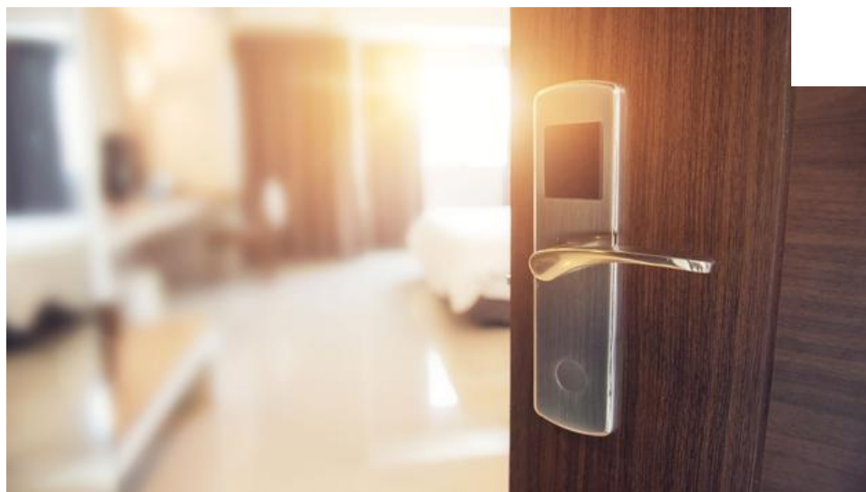
Opened door of hotel room in the morning.

HOTEL & RESORT | DONALD WOOD | MARCH 21, 2022