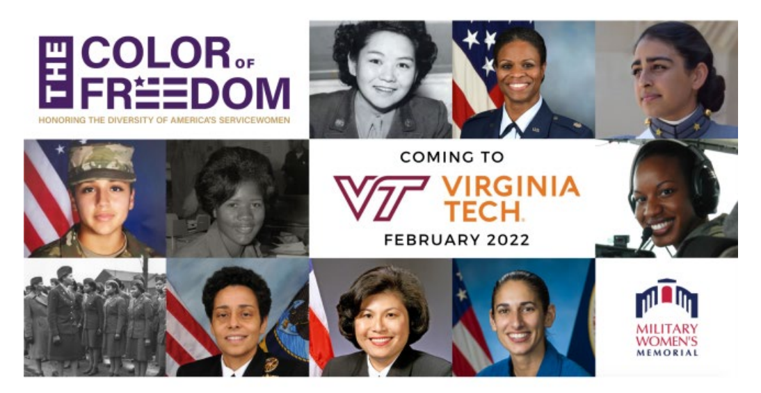
4TH FLOOR, NEWMAN LIBRARY. OPENING EVENT, FEB. 10.