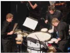
Mosaic 2010 delights audience