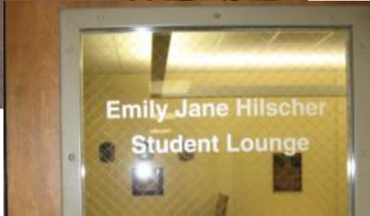
Emily Jane Hilscher Student Lounge