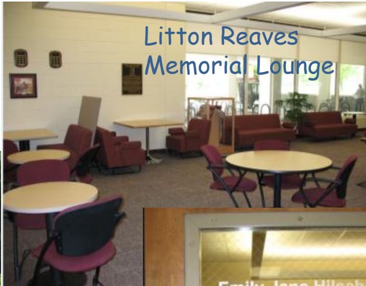
Litton Reaves Memorial Lounge