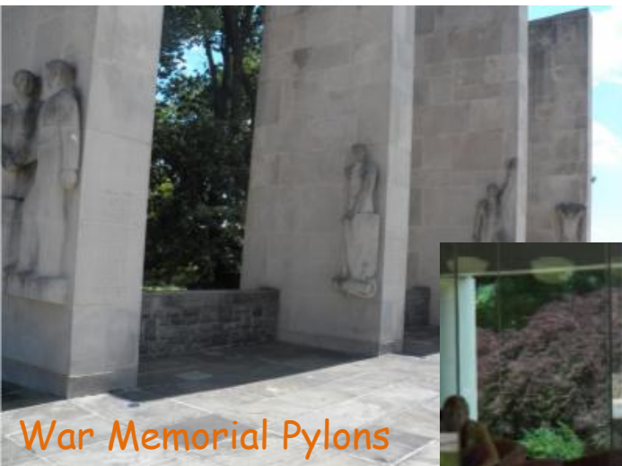
War Memorial Pylons