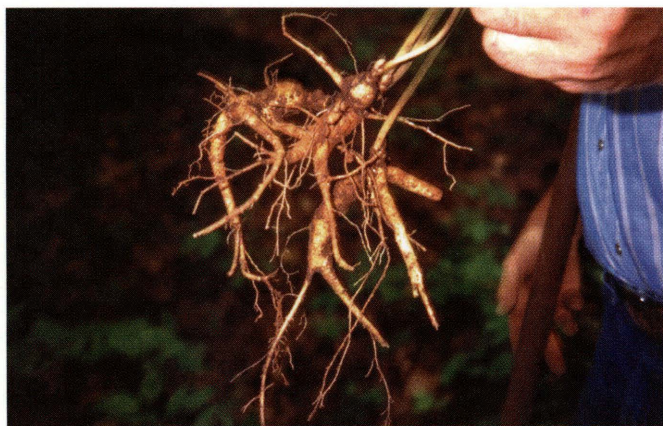
Freshly dug ginseng roots have three times more weight than dried ginseng roots.