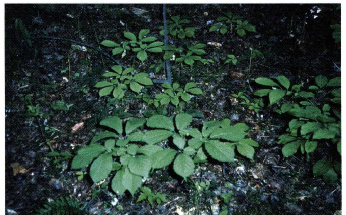
A perpetual stand of ginseng may be maintained by allowing mature plants to self-seed.

plant population in each bed will be reduced every year by natural forces. The final stand will be a thin, healthy population of wild ginseng plants. In the wild simulated method, after planting, no more work is required until the ginseng roots are dug six to 10 years later. The ginseng plants are left to the vagaries of nature. Weeds on the forest floor will compete with the plants for water and nutrients. Insects and rodents will attack certain plants. Fungus diseases may defoliate the ginseng plants. Severe weather may reduce plant growth. All of these stressful conditions result in a wild appearance of the roots that are eventually harvested. When the ginseng plants become four or five years old, they will begin producing red berries that contain ginseng seeds. The plants will self-seed and begin new populations of ginseng on the ground underneath the parent plants. This self-generation is fine but growers should not count on it for reliable future crops. Growers who want to have ginseng roots to sell every year should plant a couple pounds of seeds in new beds, every fall, for future harvests. This should not be a one-time activity.