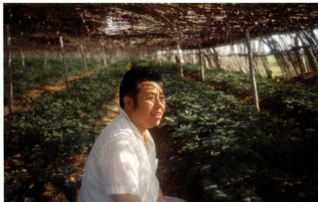
American ginseng growing under artificial shade in Jilin Province, People's Republic of China.