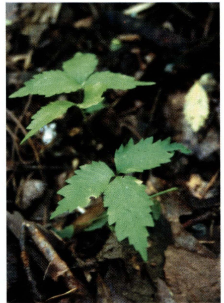
One-year old plants of American ginseng.

The stratified seed will germinate the next spring. The plants will look like three small strawberry leaves on a stem about one inch tall. Some of the seed will not germinate and some will be eaten by rodents. Over the next seven years, the