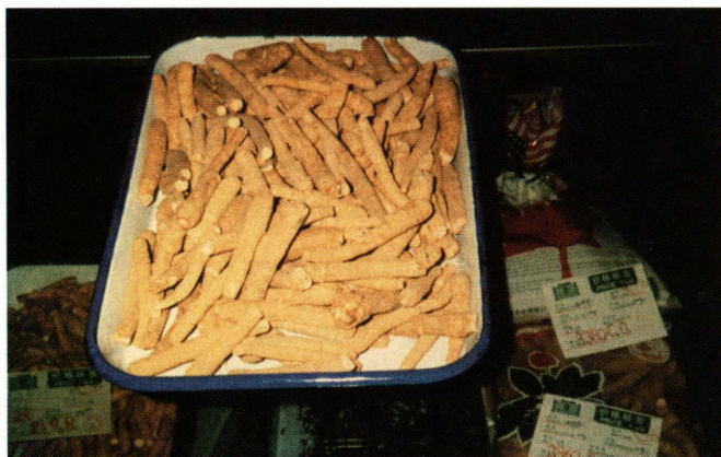
American ginseng roots are offered for sale in shops and stores throughout China. The Chinese believe that ginseng is a panacea for their health.

Experienced buyers of ginseng can easily tell the difference between wild and cultivated roots. The wild roots are dark tan in color, gnarled in appearance and show many concentric growth rings. They are often forked. Some of them resemble the body of a man. Wild roots are generally small in size and light in weight. One distinctive characteristic of a wild root is a long neck. The cultivated roots are cream colored, smooth and fat and exhibit few concentric growth rings. Cultivated roots are often large and heavy. They are most often shaped like a carrot. Ginseng grown from cultivated seed will typically have a short neck.