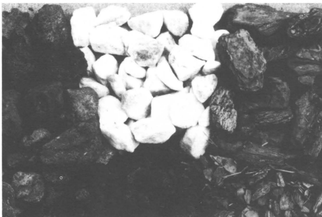
Figure 1. Loose mulch materials can be organic and inorganic, and of small or large particle size. Match the mulch

Chip and sawdust mulches from some woods, such as walnut and cedar, produce phytotoxic (plant-killing) chemicals and should be avoided.