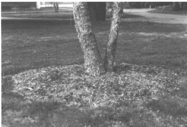
Figure 5. A properly mulched landscape tree.