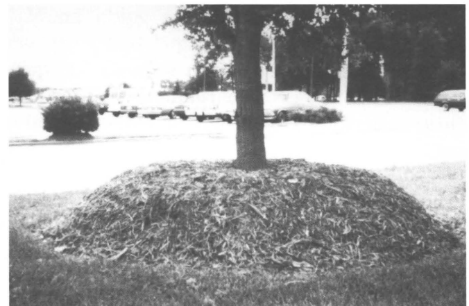
Figure 6. An improperly mulched tree. Bark layer too thick and piled up against the stem.