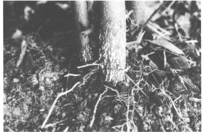
Figure 4. Piling excessive mulch against plant stems can stimulate undesirable shallow rooting in the mulch layer.