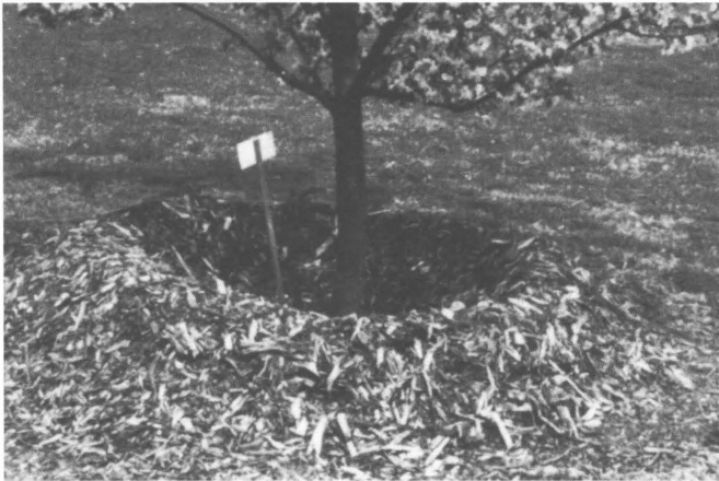
Figure 3. A mulch well can be constructed at planting time to help hold water over the rootball of the tree, but the height of this well is excessive.