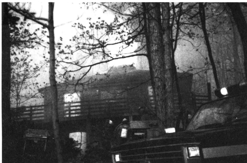
In Virginia, one of every three forest fires now threatens at least one woodland home. Forest fires damaged 98 structures in 1995 and 40 in 1996.