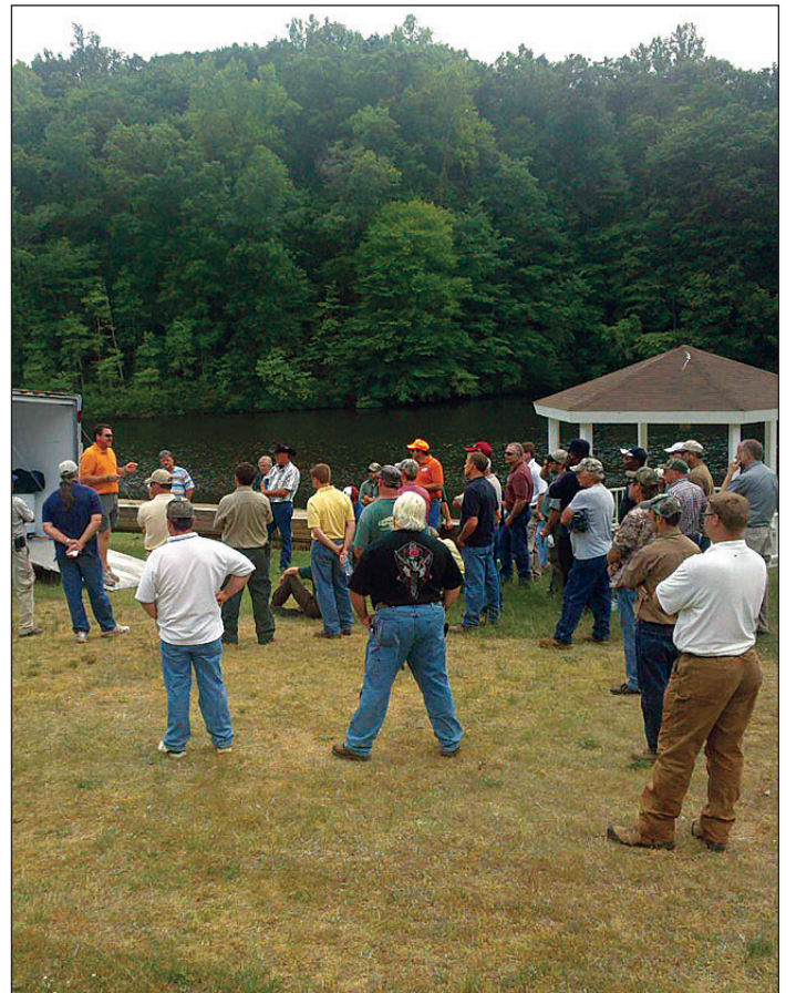
Attentive participants learn about equipment improvements that will allow for easier, more efficient, and compliant application of herbicides.