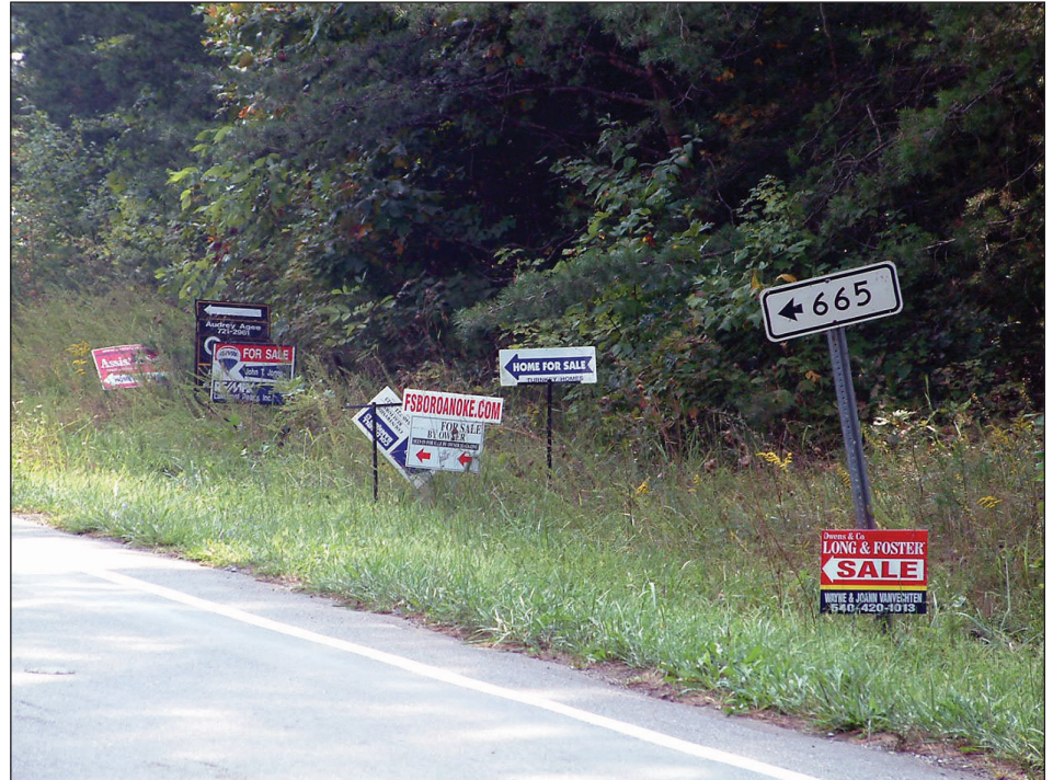
One in five acres of forestland is owned by people who plan to sell or transfer some or all of their land in the next five years.

Seed money for this project ($5,600) was provided by the Virginia Tree Farm Committee. The American Tree Farm System awarded an Education Grant ($10,000) for project continuation.