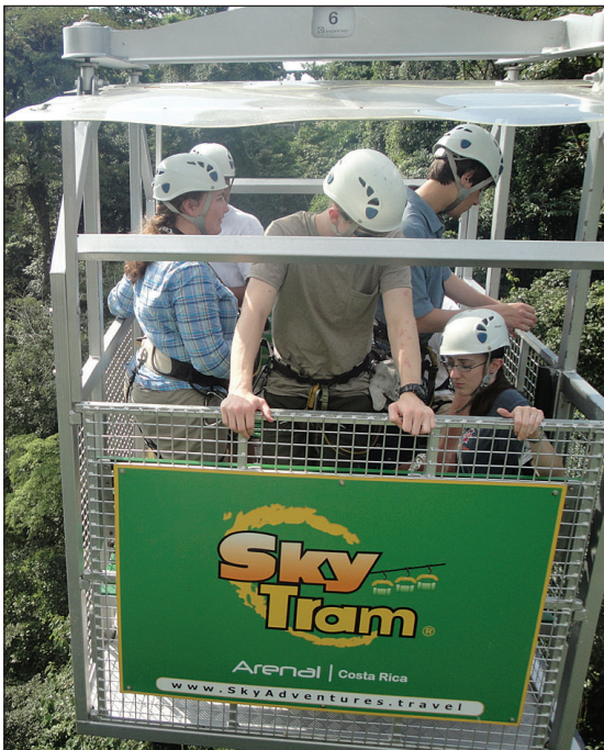
Students head towards the zip lines in Fortuna.

This course is currently being taught this spring We look forward to a new opportunity to continue improving our teaching efforts for the benefit of the future natural resources and environment leaders of the commonwealth.