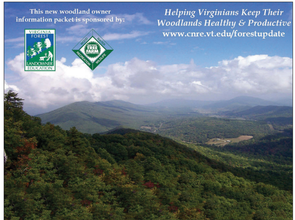
Information for the new landowner packets is contained in an attractive, professionally designed folder, which features logos of both the Virginia Forest Landowner Education Program and the American Tree Farm System.