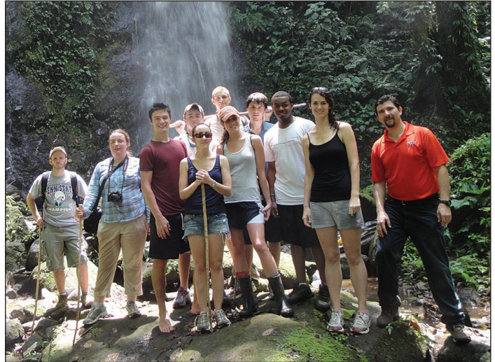
Students pose in front of the Texas A&M Research Facility in Costa Rica.

To address the first objective, connecting academics with practice, students were asked to conduct research on the sustainability of Costa Rica before their field trip. Students perceived the country as sustainable where economic development was highly dependent on tourism, and as a direct consequence, they thought the country would be clean, with neat infrastructure, and few social problems. Upon their return to the United States, the students were asked again for their perceptions of