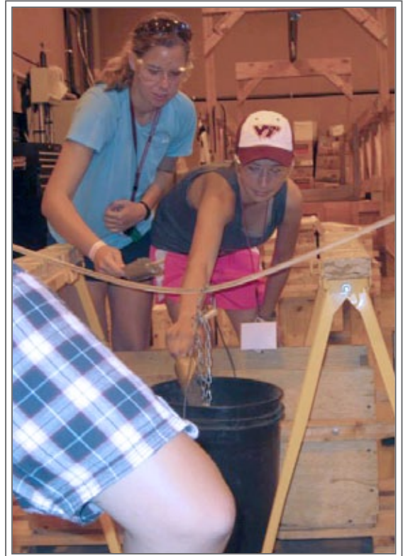
YCC students see how much a piece of wood will bend before it breaks.

For 36 years, the Virginia Association of Soil and Water Conservation Districts has sponsored the week long YCC summer event. The event sponsors students to spend one week learning about Virginia's resources through hands-on experiences to help them gain a deeper understanding and respect for the environment and our natural resources. Photos of the 2013 YCC activities can be seen online at the Virginia Association of Soil & Water Conservation Districts' Facebook page.