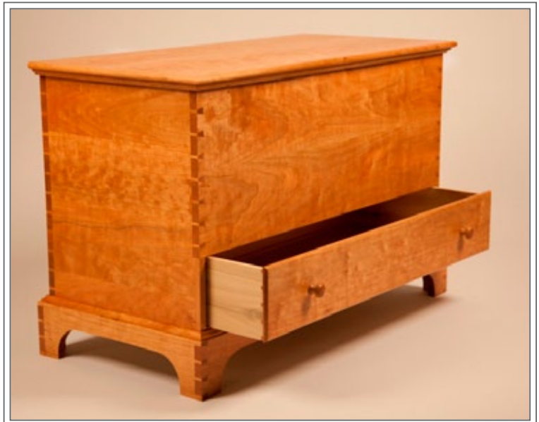
The winning Shaker blanket chest.

Cole used his research from literature, magazines, and observation to test both modern manufacturing methods as well as traditional craft methods to determine which would perform best in terms of function, quality, and aesthetics observed during the Shaker period. Ultimately, a balance of both modern and traditional methods were combined to complete the winning blanket chest. For Cole to achieve the distinguishing “custom” look of the chest required hand cutting of the dovetail construction. “Having never hand-cut dovetails of this magnitude, the four dovetailed corners presented a challenge in both layout and execution. I spent many hours gathering information and then testing methods to make sure high quality cuts could be repeated consistently before making the final corner pieces,” Cole stated.