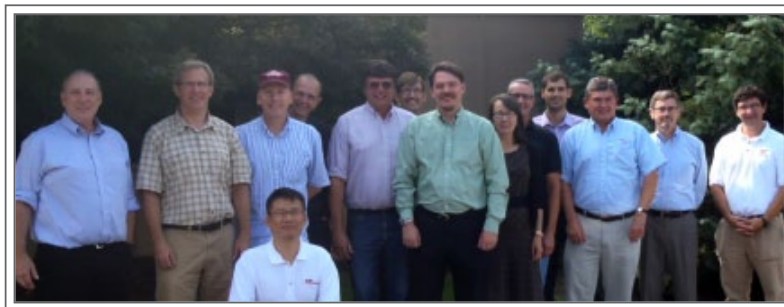
Department of Sustainable Biomaterials Faculty

Our faculty met this August to plan for the upcoming year. We spent the morning having each faculty member describe their programming efforts, including teaching and research. It always amazes me the breadth of our research program. We have faculty working with cellulose derivatives to make bones heal faster or replace bones, testing new cross laminated beams to open new markets for wood, and trying to improve steel's performance by implanting cellulose nano-tubes. The afternoon session was spent establishing some clear goals to work on for the year. My old business training has me a strong believer in Management by Objectives (MBO).