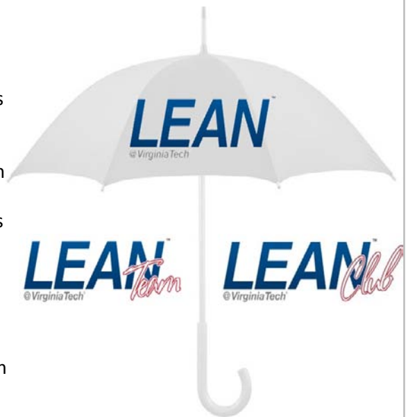
Lean@Virginia Tech's organizational structure

Lean@VirginiaTech , the University's dynamic group of lean-thinkers is a student-driven, faculty-supported, non-profit initiative to help organizations become more competitive through successful lean transformations. The VTLeanTeam's objectives are to give students the opportunity to gain real-world lean transformation experience through industry excursions, research projects, and active involvement in lean activities while supporting industry in its strive for better competitiveness. Creating an environment for organizations to share their lean transformation experiences is the second objective of Lean@VirginiaTech. The VTLeanClub allows companies to build a lean network with other organizations, students, and faculty to support their lean transformation activities. VTLeanClub membership provides free access to workshops and summits involving industry speakers and lean experts organized by Lean@VirginiaTech. VTLeanClub membership also gives members access to Lean@Virginia Tech's lean benchmarking database and the team's students and alumni. Pictured to the right is the concept of Lean@Virginia Tech, the VTLeanTeam, and the VTLeanClub. More information can be found at the group's website at: http://vtlean.org/