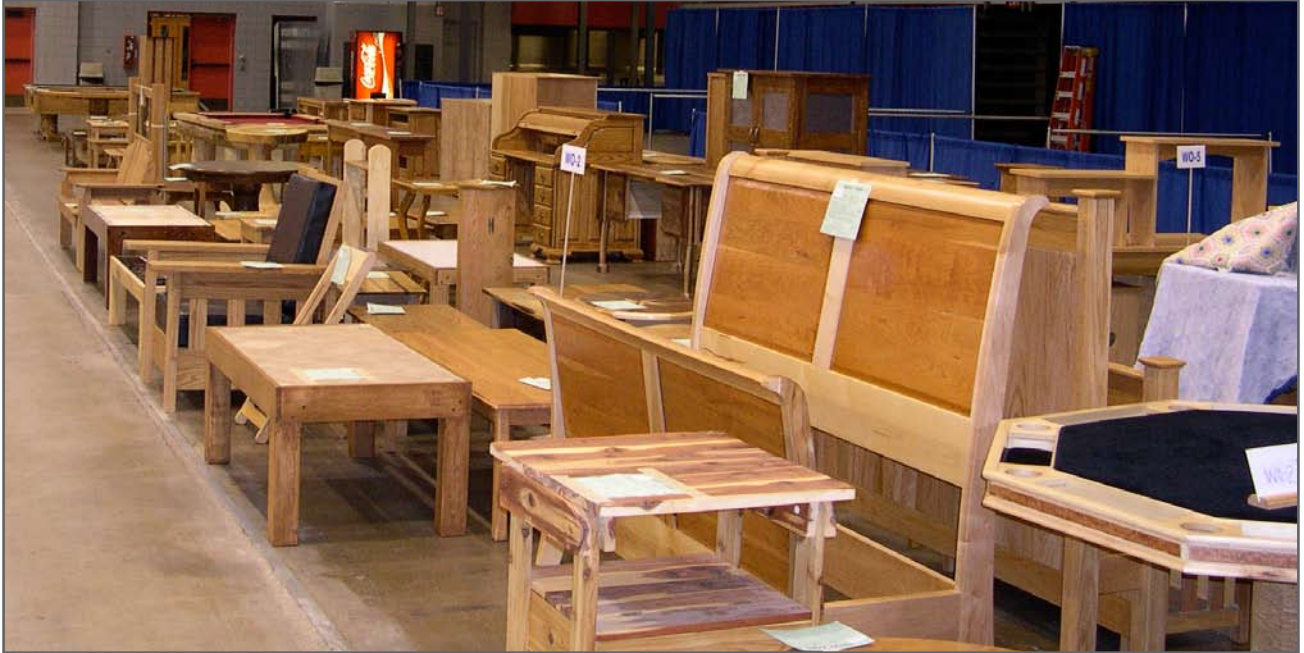
Just some of the entries at the MITES competition, including beds, chests, dressers, game tables, chairs and many, many other items.