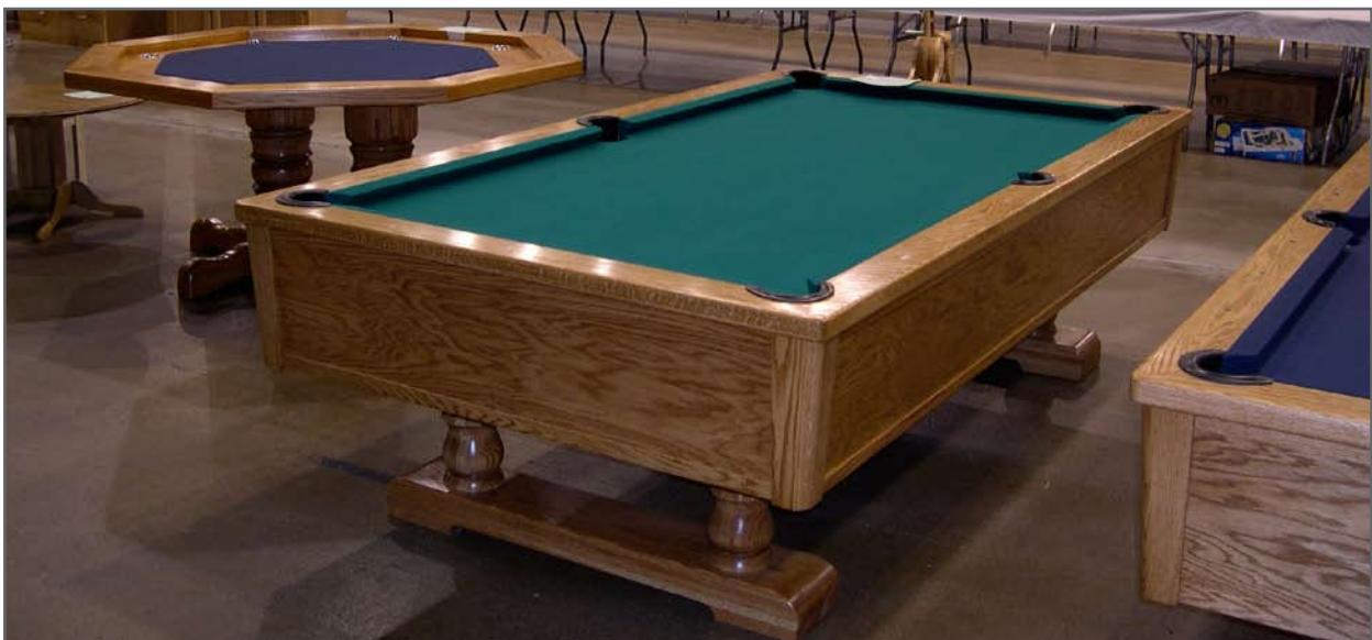
Pool tables were popular. The student who made this was enrolling in Civil Engineering in a Michigan University.