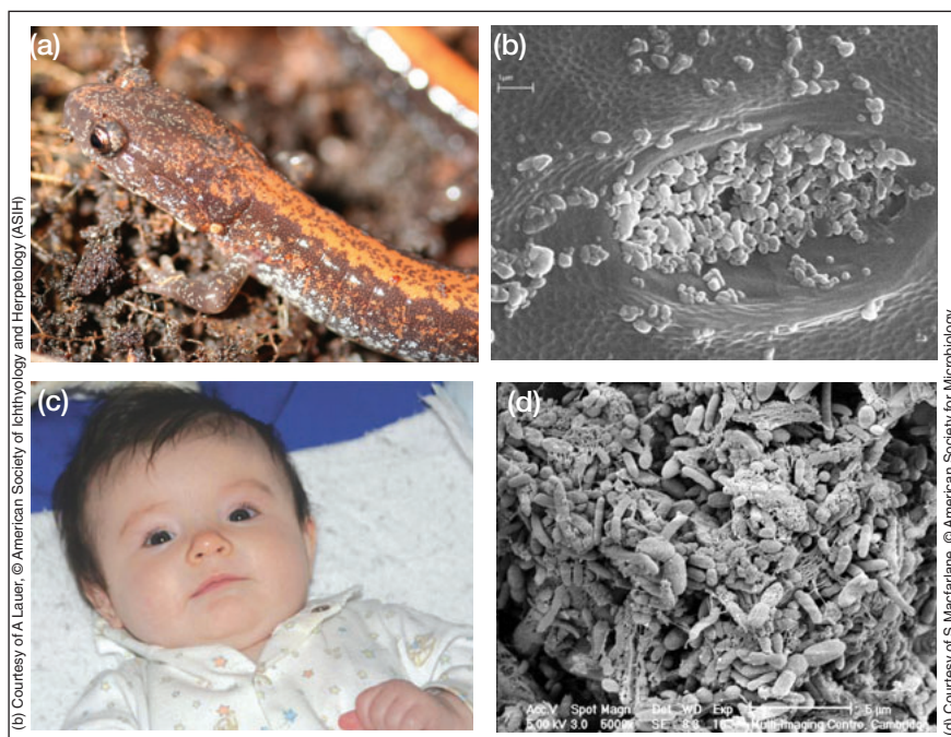
Figure 1. All organisms serve as hosts to a diverse microbiota. (a) Redback salamanders live in forests of the eastern US and (b) have a diverse microbiota growing on their skin, many members of which have antimicrobial properties (reprinted with permission from Lauer et al. 2007). (c) Human infants begin developing their microbiota during passage down the birth canal. By the time adulthood is reached, approximately 1.5 kg of body mass will be composed of (d) prokaryotic cells, like those shown here, from the human intestinal tract (reprinted with permission from Macfarlane and Macfarlane [2006]).

light organs filled with luminescent bacteria, which eliminate any silhouette visible to predators (Jones and Nishiguchi 2004), and some legumes make use of symbiotic nitrogen-fixing bacteria when nitrogen is limiting in the environment (van Rhijn and Vanderleyden 1995). These examples represent a tiny fraction of the non-pathogenic microbes that have metazoans and plants as hosts. We know very little about how most members of the natural microbiota contribute to, or detract from, host life, but research in this area is growing, especially in terms of health and disease.