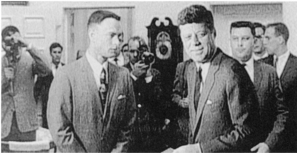
Digital compositing in Forrest Gump

Digital imaging technologies are rapidly transforming nearly all phases of contemporary film production. Film-makers today storyboard, shoot, and edit their films in conjunction with the computer manipulation of images. For the general public, the most visible application of these technologies lies in the new wave of computer-generated and -enhanced special effects that are producing images—the watery creature in The Abyss (1989) or the shimmering, shape-shifting Terminator 2 (1991)—unlike any seen previously.