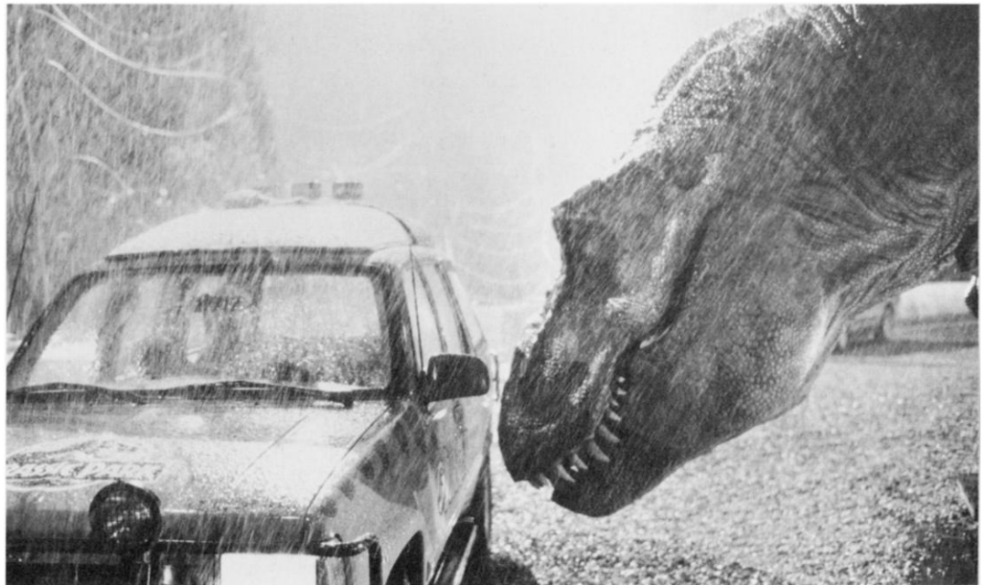
Jurassic Park: not the real T. Rex

began as a wireframe model in the computer, no profilmic referent existed to ground the indexicality of its image. Nevertheless, digital imaging can anchor pictured objects, like this watery creature, in apparent photographic reality by employing realistic lighting (shadows, highlights, reflections) and surface texture detail (the creature’s rippling responses to the touch of one of the film’s live actors). At the same time, digital imaging can bend, twist, stretch, and contort physical objects in cartoonlike ways that mock indexicalized referentiality. In an Exxon ad, an automobile morphs into a tiger, and in a spot for Listerine, the CGI bottle