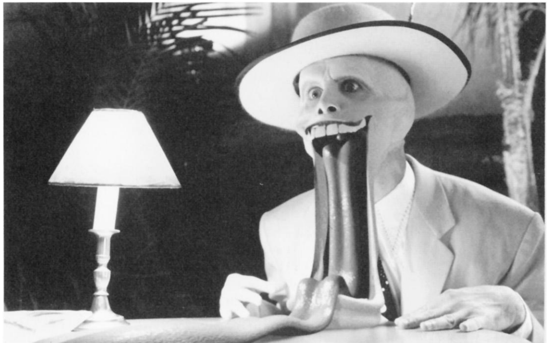
Computer imaging in The Mask

either indexically records the world or stylistically transfigures it. Cinema does both. Similarly, digital-imaging practices suggest that contemporary film theory's insistence upon the constructedness and artifice of cinema's discursive properties may be less productive than is commonly thought. The problem here is the implication of discursive equivalence, the idea that all cinematic representations are, in the end, equally artificial, since all are the constructions of form or ideology. But, as this essay has suggested, some of these representations, while being referentially unreal, are perceptually realistic. Viewers use and rely upon these perceptual correspondences when