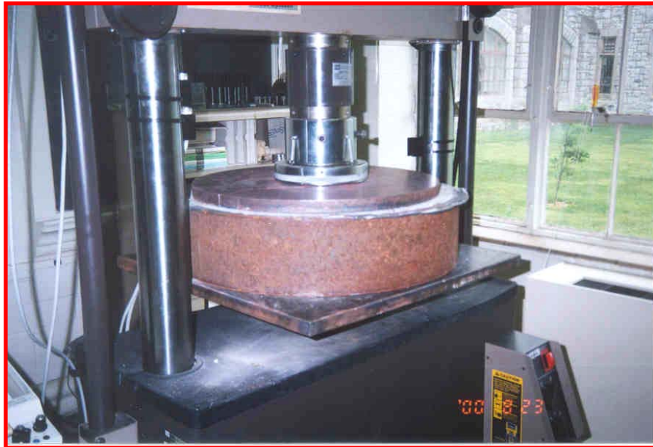
Figure C.2 VT Pushout Test Setup

The Virginia Tech tests were performed by bonding the outside of the FRP shell to a slightly larger steel pipe section, supporting the steel pipe section, and pushing the concrete core so it begins to move out of the FRP shell. Tests were carried out at a displacement rate of 0.002 in per minute. The Virginia Tech test setup for the pushout tests is shown in Figure C.2.