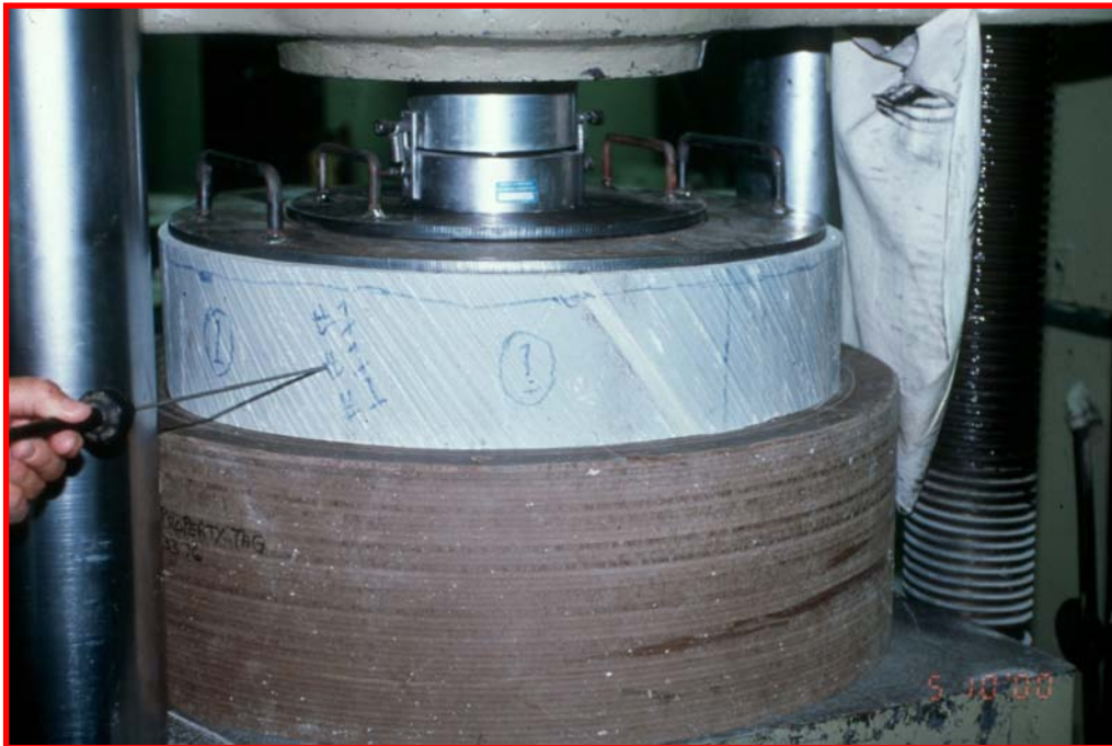
Figure C.1 VTRC Pushout Test Setup

Some of these tests were performed by the Virginia Transportation Research Council (VTRC), and some were performed by Virginia Tech (VT). Each institution used a different test setup. The VTRC tests were performed by setting the test specimens on a block with a carefully fabricated hole that permits the block to support the FRP shell but allows the concrete core to pass through the hole. The load was applied at a rate of 3000 lbs/min. The VTRC test setup is shown in Figure C.1.