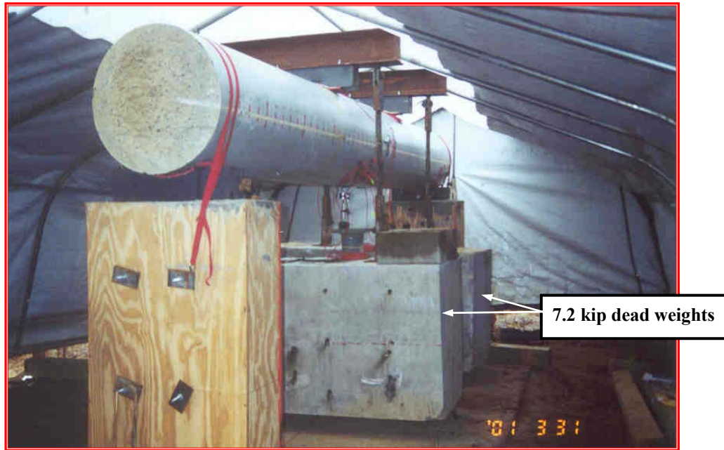
Figure C.3 Creep bending test setup