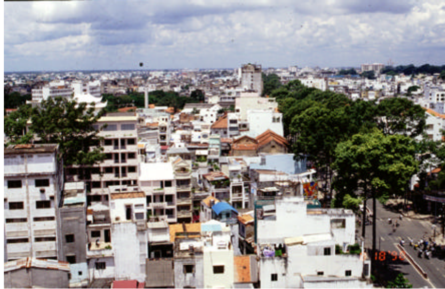
Top: Ariel photo of Vietnam Bottom: Governor Palace