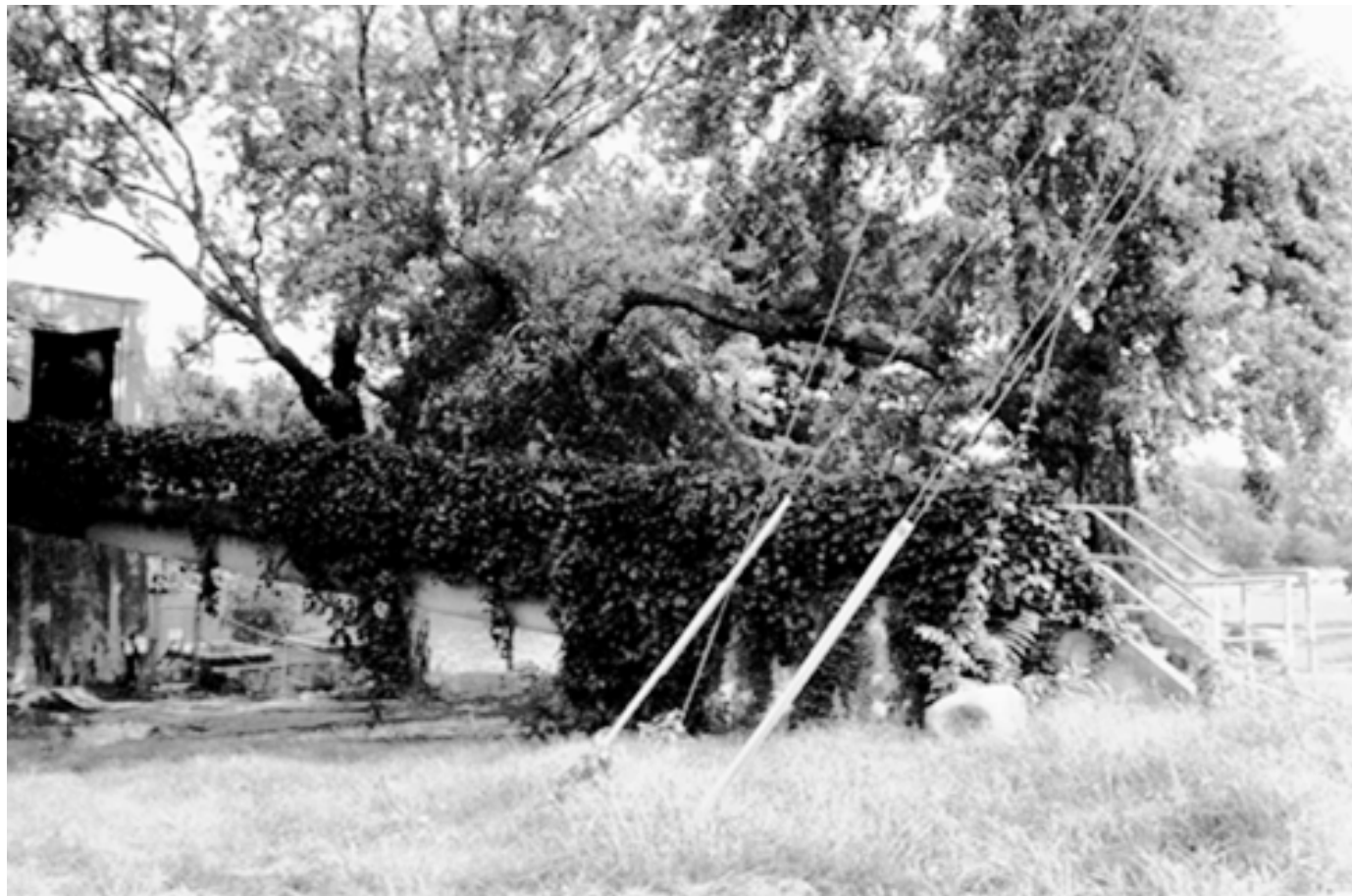
The bridge gestures toward the town.