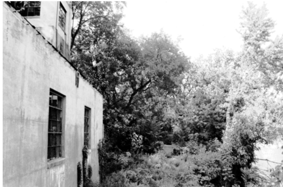
The water processing plant is a backdrop to the site. It exists as a tower, a bridge to the top of the hill, and two lower buildings.