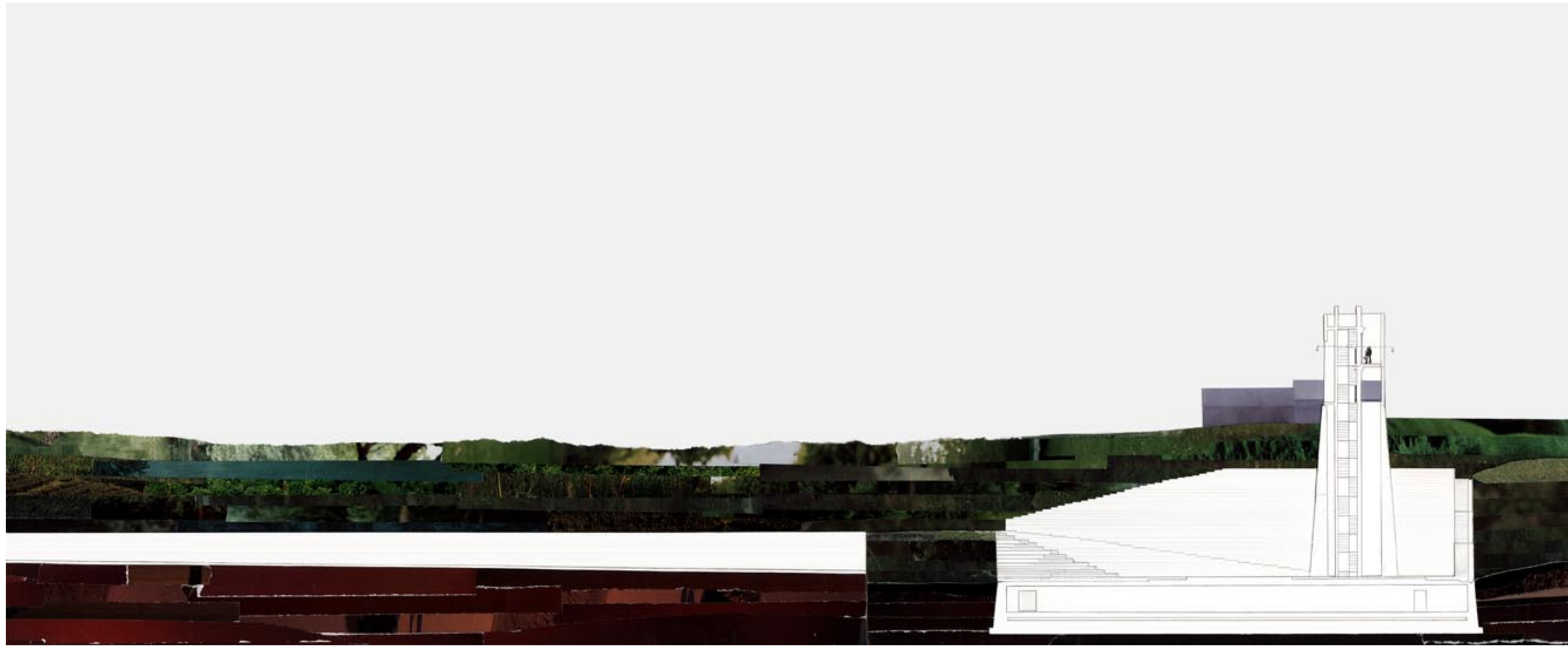
Section through the length of the site.