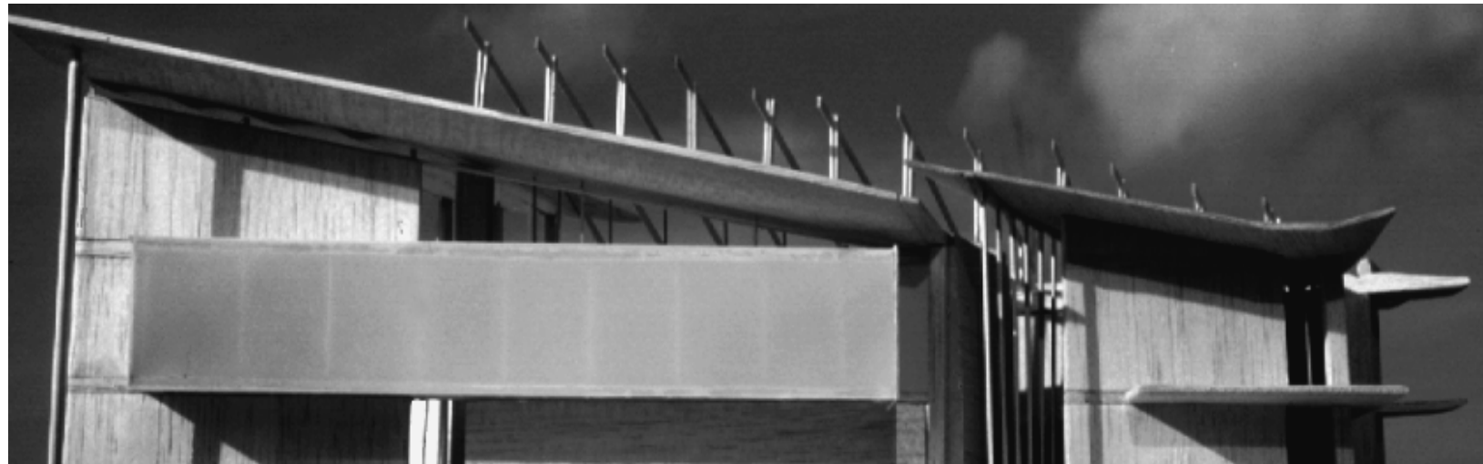
One can swing into the library through the small door in the middle of the wall.