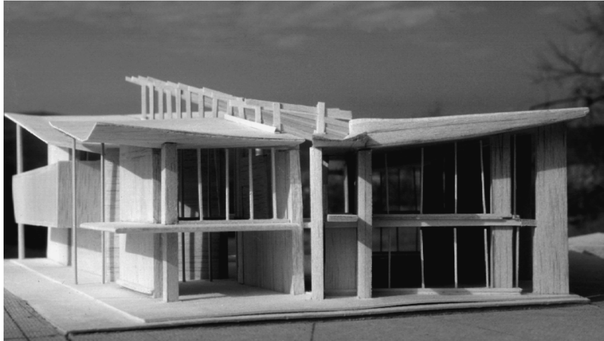
This southern corner is the enclosure for the plaza - school yard.