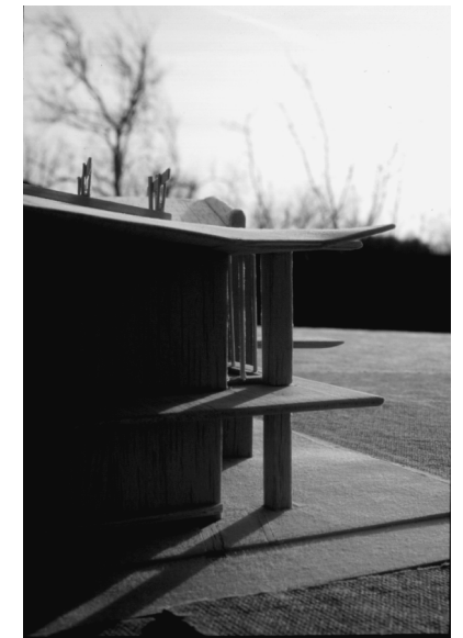
If it had been raining, the water from the roof would be forming the waterfall down the slanted concrete wall.