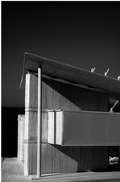
This corner column marks the beginning of the Liberative space.