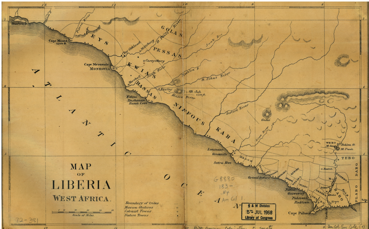
Figure 1: Liberian claims as of 1830 Map of Liberia, West Africa. N[ew] Y[ork]: Lith. G.F. Nesbitt & Co., [183-?]; Library of Congress, Geography and Map Division

The French and Liberian Governments finally settled a substantial negotiation in 1892, delineating the boundary between Liberia and the Ivory Coast. This agreement, however, resulted in Liberian loss of nearly two hundred miles of coastal territory. 57