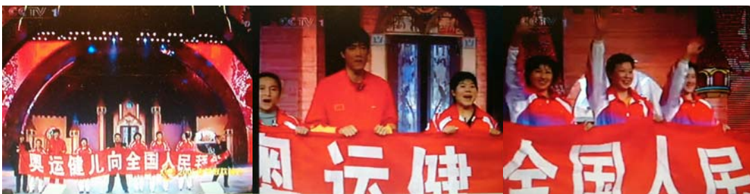
Picture 6: Three Athens Olympic champions and three members of China’s national women volleyball team are greeting to the audience in 2005 gala.