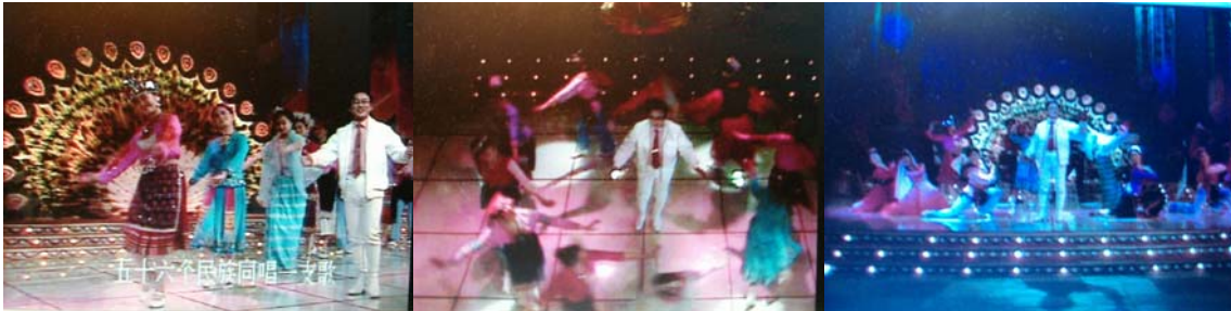
Picture 1: A song “56 Ethnic Groups Singing One Song” in the 1986 gala