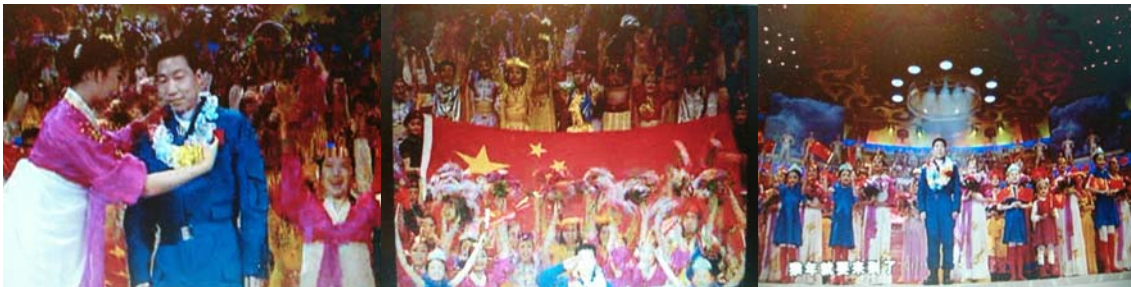
Picture 7: Yang Liwei becomes the center of the midnight count down in the 2004 gala.