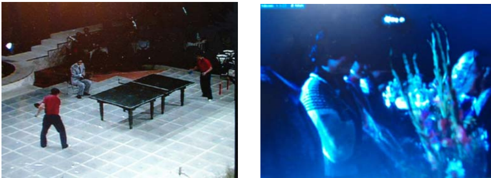
Picture 5: Two athletes play ping pong in 1984 gala, and the members of China’s national women volleyball team present flowers to the logistical staff in 1985 gala.