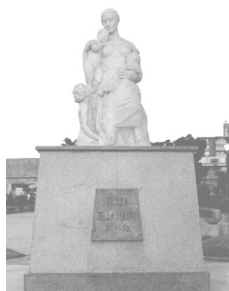
Figure 14 Mother Statue of Plaza de la Madre