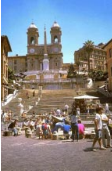
Piazza Espana, Rome