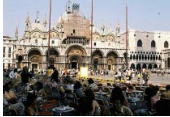
Piazza San Marco, Venecia

Architecture as an act of social intervention is the concept of this project. Careful consideration of context and surrounding as well as community needs are the forces behind the creation of a building that is both a place of transition and interaction; a place that both philosophically and programmatically intends to enhance the life of the town's population by promoting social and civic togetherness. Through the architectural concept of flexibility it is my intention to make a center that would not only house several permanent activities at once, but will also be able to host as many types of temporary activities as the community can imagine. The building intervening as a social unifier provides both the local and the university communities a place to interact and play together. The chosen site is ideal for this project, since its location is considered as a bridge between downtown and the university campus, thus making it easier to generate an activity space where both could meet throughout the year. The proposed building design reflects this "bridge" condition of the site by turning itself into an urban icon of different qualities; the building that becomes a plaza, the plaza that becomes a building.