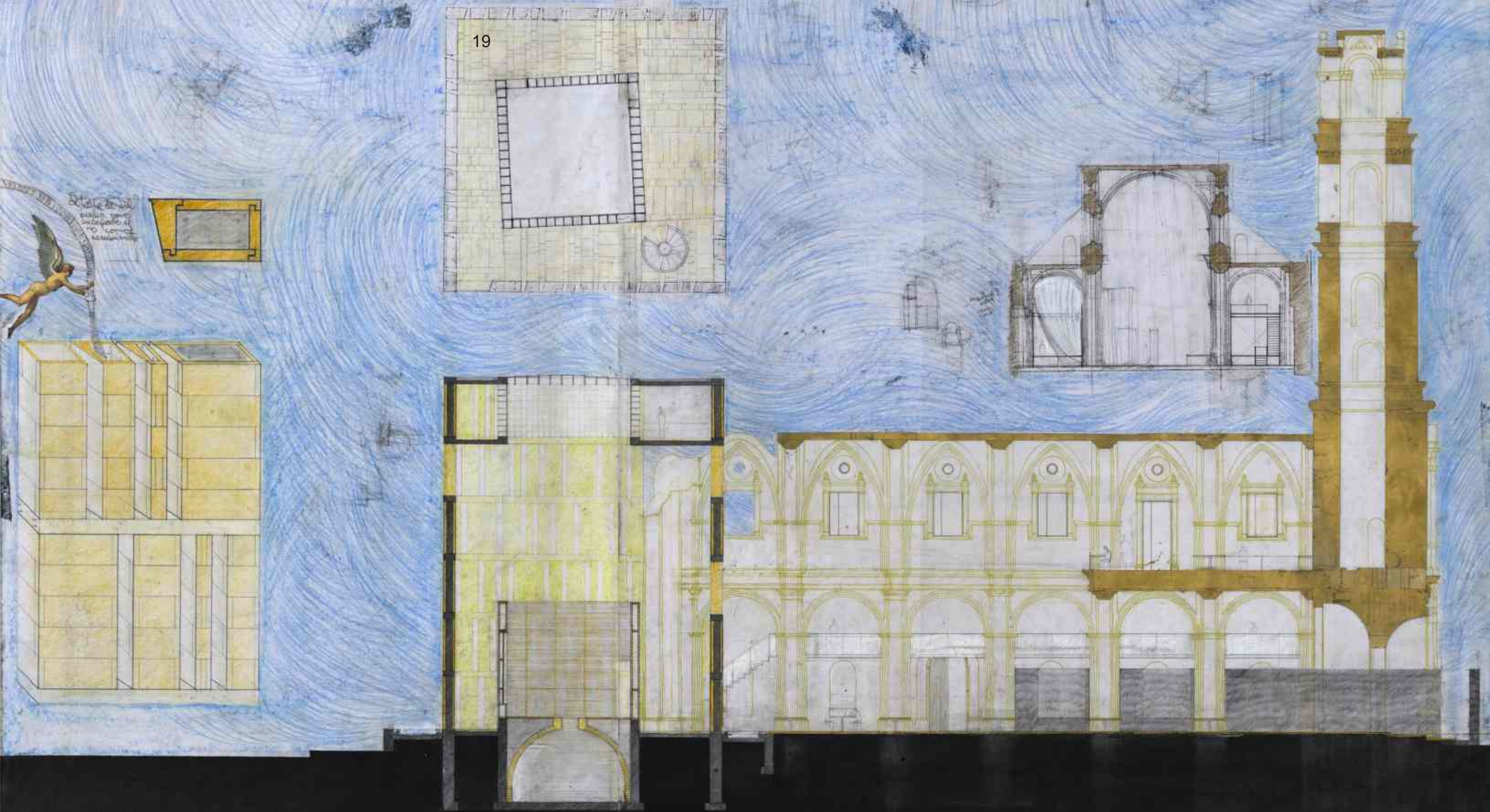
Fig. 12 Studios and jury room section