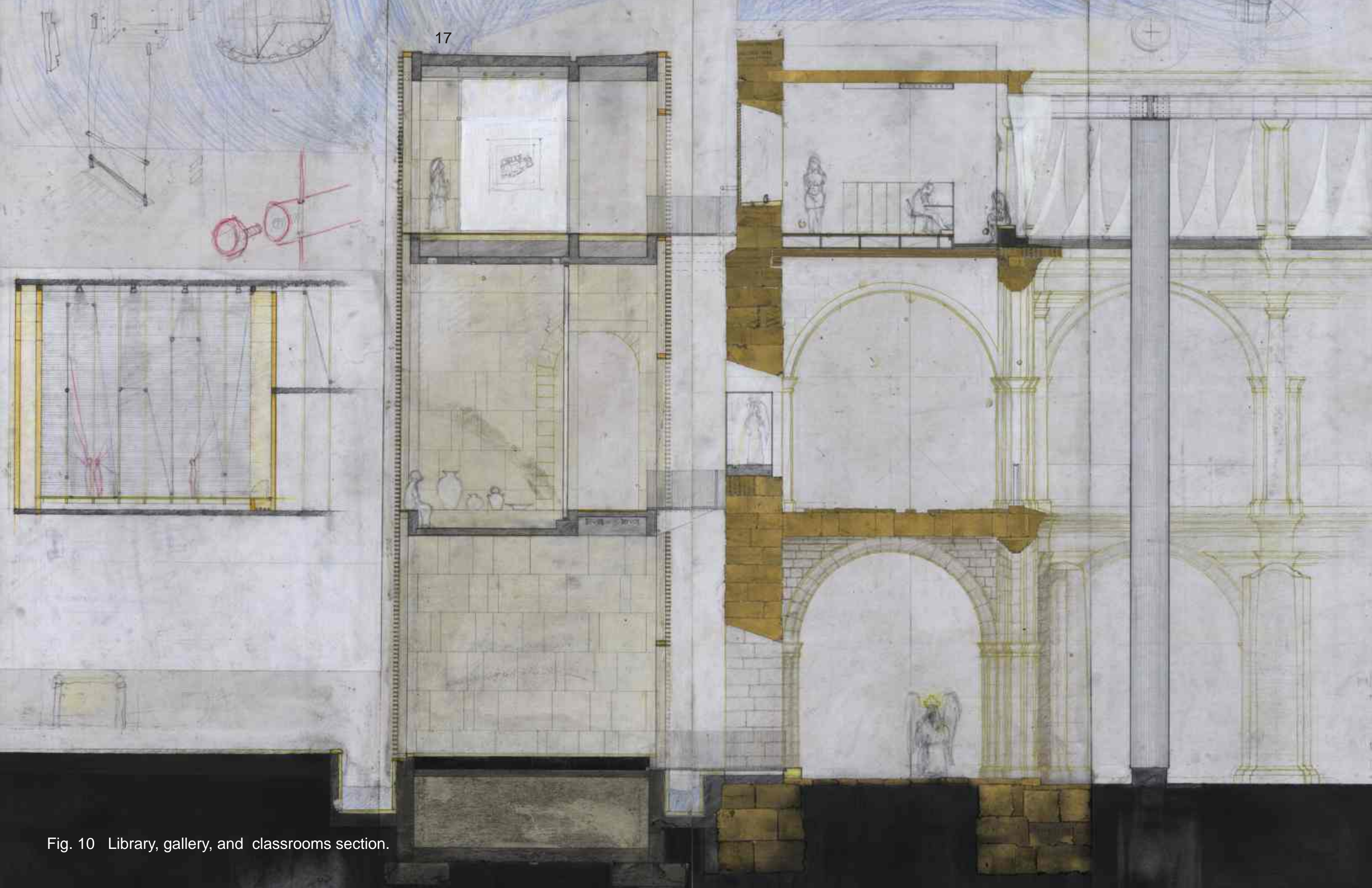
Fig. 10 Library, gallery, and classrooms section.