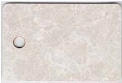
Table and counter tops