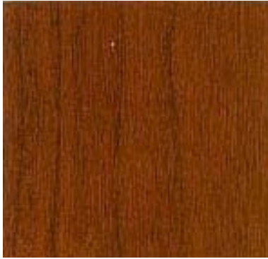
Cherry wood for floor covering