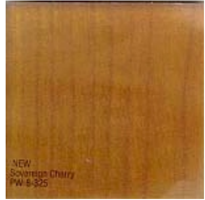
Cherry wood for tables and chairs