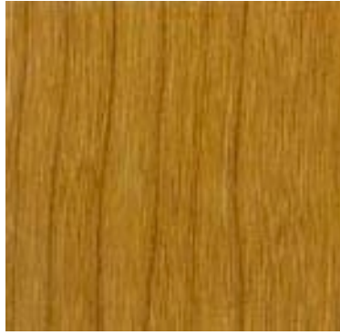
Cherry wood for walls and counters