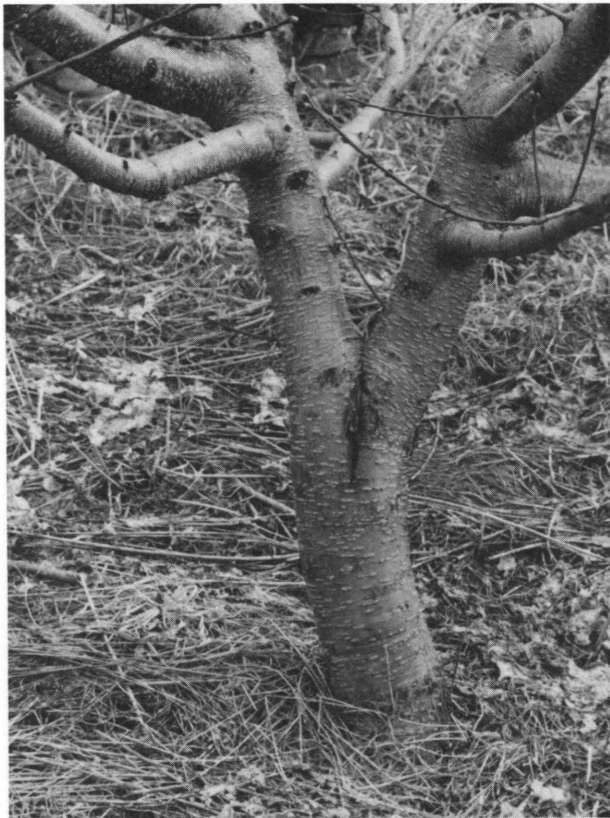
Figure 4. A "V" crotch is weak and susceptible to splitting, winter injury, and canker. One branch should have been removed during the first winter to avoid the weak crotch.

the trunk. Some trees will not have 3 acceptable limbs at the end of the first season, but excellent trees can be developed with only 2 main branches. Sometimes, 4 to 6 desirable limbs will grow at one point on the trunk. It is best to remove all but 3 of these branches because there will eventually be 3 dominant limbs and the others will be squeezed out.