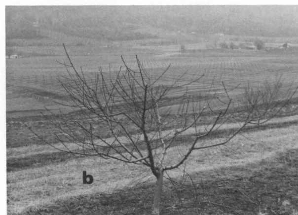
Figure 5. A three-year-old peach tree before (a) and after (b) dormant pruning. Note the removal of upright vigorous shoots and the retention of the best fruiting shoots.