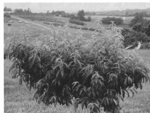
Figure 6. A two-year-old peach tree in late June showing upright shoot growth that is shading the tree center.