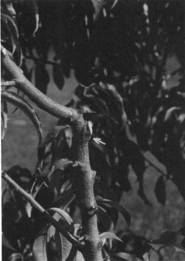
Figure 1. Use "collar cuts" for rapid wound healing rather than "flush cuts".

The number and distribution of flower buds on a shoot can vary with tree vigor, the variety, and the light environment that the shoot developed in. Results from a variety trial in New Jersey indicate that 'Jerseygold' and 'Springgold' had 20 to 23 flower buds per foot of shoot length, whereas 'Harken' and 'Emery' averaged only 15 flower buds per foot of shoot length. Shoots that grow less than 6 inches generally have the most fruit buds per inch of growth. The total number of fruit buds per shoot increases as the shoot's growth increases to about 2 feet.