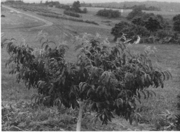
Figure 7. The same tree after summer pruning. The upright shoots in the tree center were removed and vigorous shoots were pinched back to outward-growing secondary shoots.