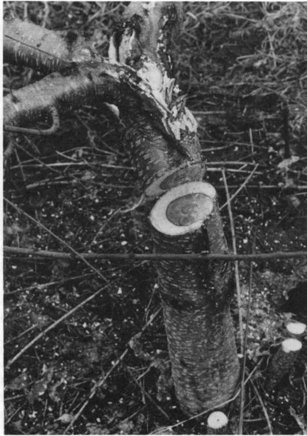
Figure 9. Winter-injured peach tree showing "blackheart" and bark splitting. Such trees usually survive and grow reasonably well if pruned moderately and fertilized.

Virginia Cooperative Extension Service programs, activities, and employment opportunities are available to all people regardless of race, color, religion, sex, age, national origin, handicap, or political affiliation. An equal opportunity/affirmative action employer.