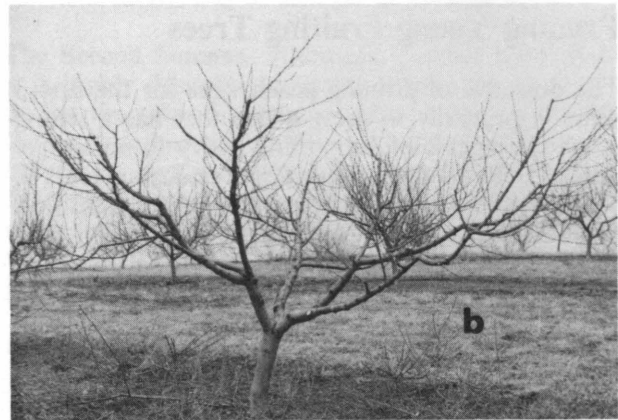
Figure 8. A well-trained five-year-old peach tree before (a) and after (b) dormant pruning. Note the 3 wide-angled scaffold branches and the low spreading, open-center appearance. Vigorous upright shoots and low branches have been removed. Upright branches have been thinned to outward-growing shoots and only good fruiting shoots have been retained.

shoots, helps control production of excess fruit and the amount of fruit thinning, and improves fruit size. Also remove the 3- to 6-inch-long fruiting shoots that are mixed with the more desirable 12- to 18-inch shoots. The shorter shoots produce small fruit. A thorough pruning job requires time and labor (10 to 15 minutes per tree), but it also saves time and labor during thinning.