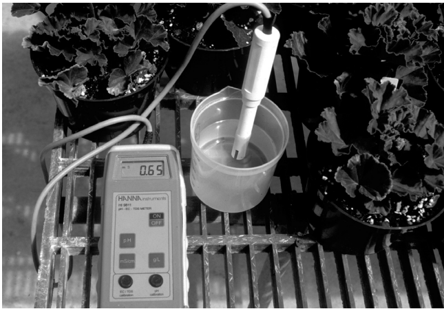
Figure 2. Portable electrical conductivity (EC) meters can be used to measure the EC of the dilute fertilizer solution to verify that the injector is working within the expected range. Compare the EC of the solution to that recommended on the fertilizer bag (Fig. 3) or the fertilizer label.

Example 1. A grower used the procedure described above for testing a fertilizer injector. Ten gallons of water were collected in a barrel, and 13 fluid ounces were depleted from a measuring cup. What is the injector ratio for this fertilizer injector?