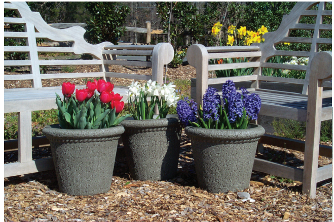
Individual pots of tulip Blue Base, daffodil Horn of Plenty, and hyacinth Blue Jacket (top). One pot with tulip Blue Base, daffodil Jenny, and hyacinth Blue Jacket (right).