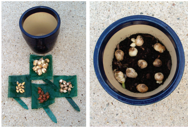
Bulbs laid out for layering (left), and the first layer – the daffodils – ready to be covered (right). Note the blue ceramic pot used to help reinforce the red-white-blue color scheme.