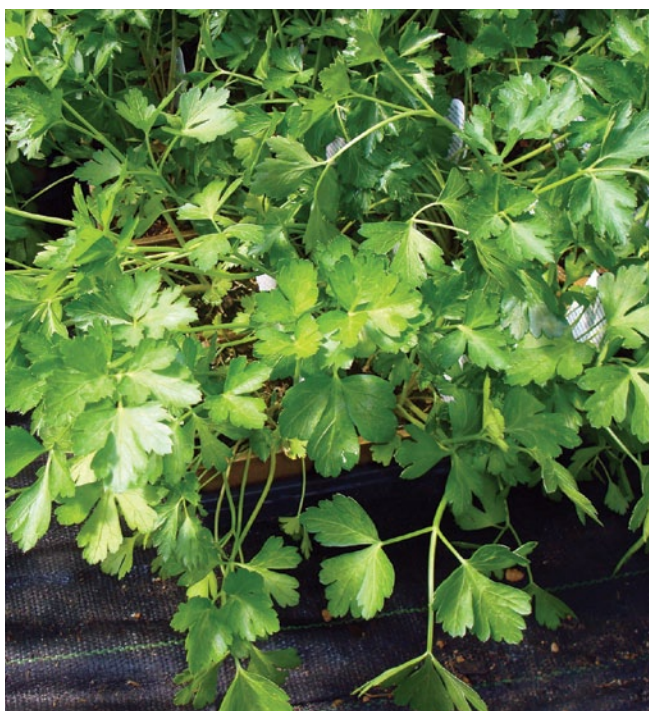
Parsley ( Petroselinum crispum )

Proper nutrient balance is very important. Weak, succulent growth can be caused by over-fertilization, making the plant susceptible to disease and insect pests. Rapid growth also dilutes the concentration of essential oils that impart the distinctive flavor to the culinary herb.