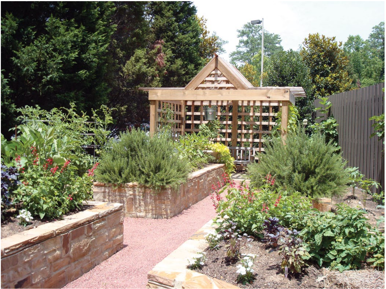
Herb garden with raised beds.