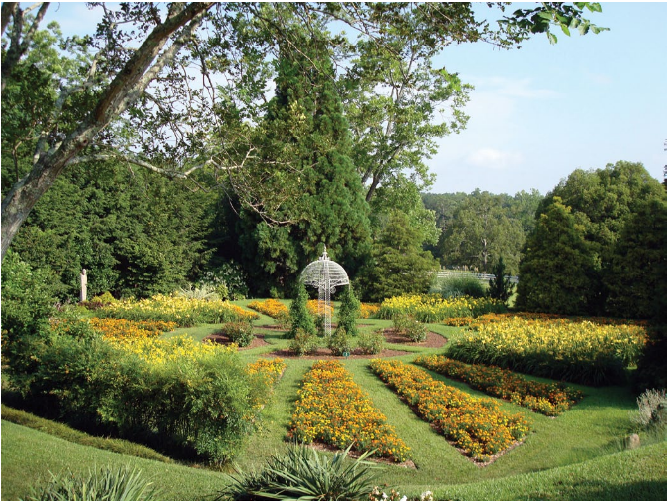
Formal garden layout.