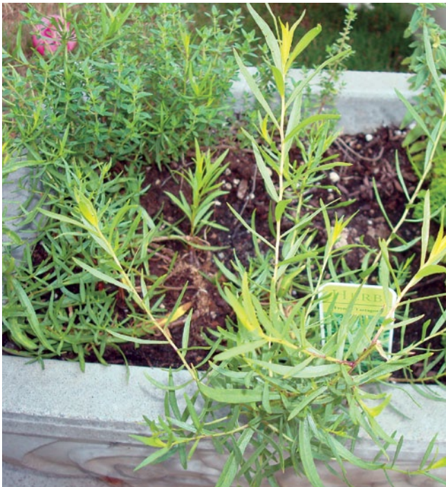
French tarragon ( Artemisia dracunculoides ).

Herbs may also be dried by removing the leaves and spreading them in a single layer on cookie sheets or foil, though it is preferable to use trays made of window screening for maximum air circulation. Again, remember to label the different varieties for accurate identification after drying.