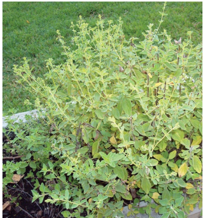
Oregano ( Origanum spp. )

Many other herbs can also be propagated from stem cuttings, including rosemary, thyme, lemon verbena, scented geraniums, oregano, and wormwood. Transplant all herb plants after the danger of severe frost has passed. Control weeds during the growing season to