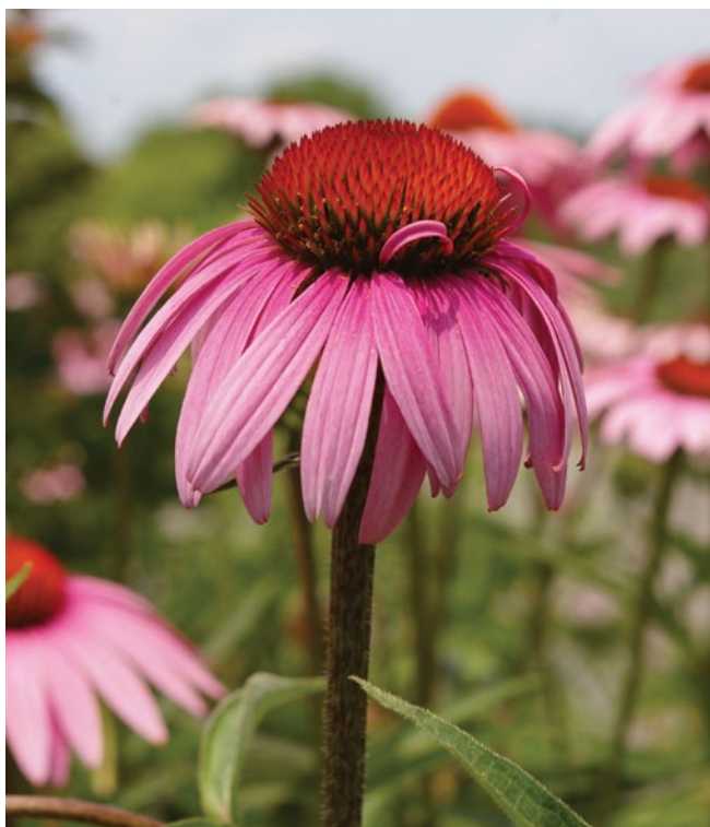
Purple coneflower ( Echinacea spp.)

Many families in the 18th and 19th centuries had their own herb gardens. These herbs were used for flavoring foods, as preservatives, and for medicinal uses. Herb gardening is also on the rise in recent years as more people grow herbs for fresh use, drying, or freezing. An interest in medicinal herbs has also bolstered interest in herb gardening.