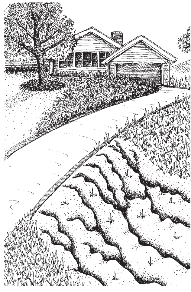
Virginia Cooperative Extension