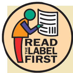
Table 4. Read the product label.

The pesticide label is a legal document and using a pesticide in any manner other than those specified on the label is a federal offense.