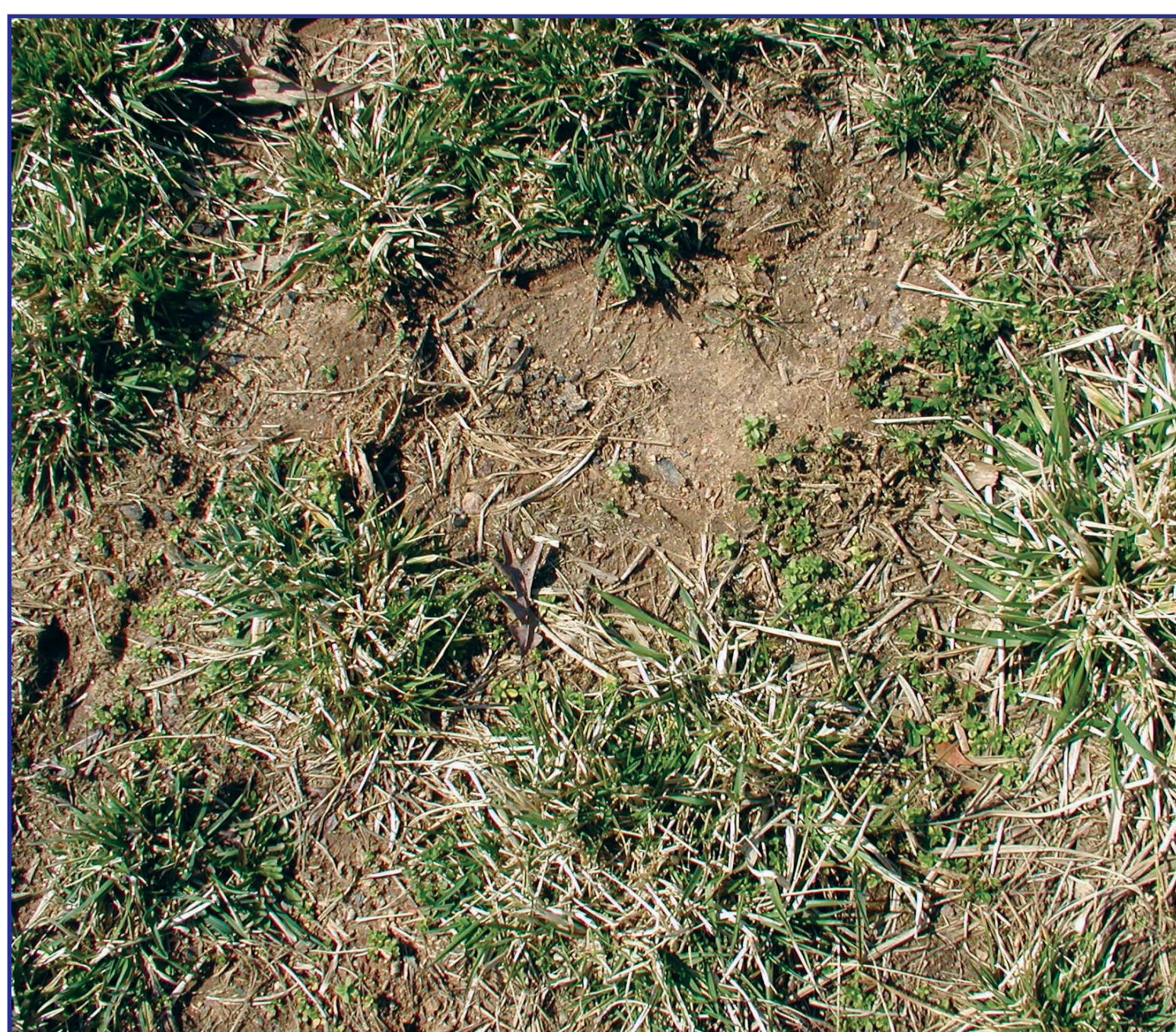
Close and frequent grazing weakened this sod, resulting in a pasture that is less productive and more susceptible to erosion and weed encroachment.