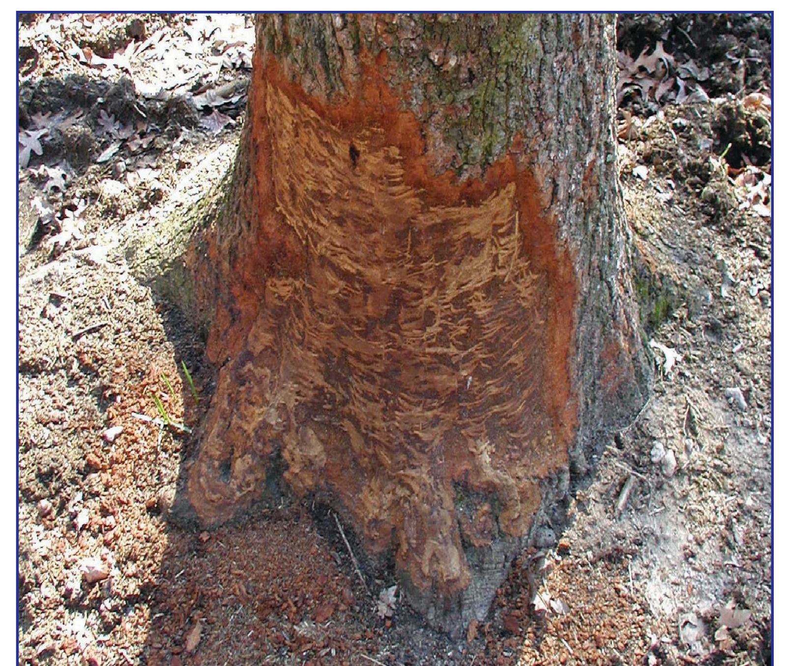
Trees must be fenced out to avoid girdling by horses. In this photo an unfenced tree has been fatally injured.

For more information on maintaining healthy horse pastures, contact your local Virginia Cooperative Extension Office or visit the Virginia Cooperative Extension website at http://www.ext.vt.edu/resources/ .