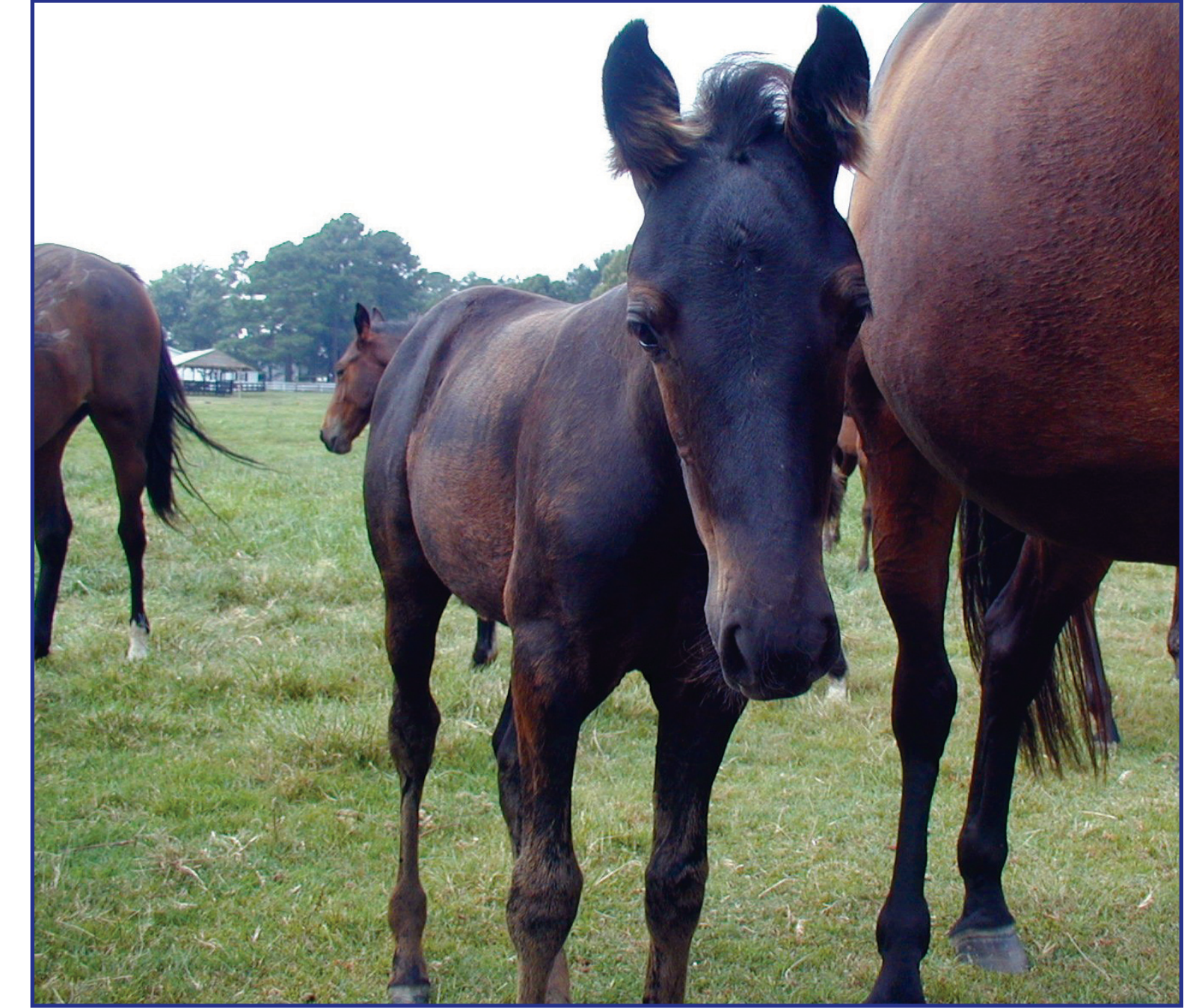
Healthy pasture sods supply a safe exercise surface for growing foals.

USE ELECTRIFIED POLYTAPE TO CONTROL GRAZING. For this type of fencing to be effective, it must be electrified at all times.