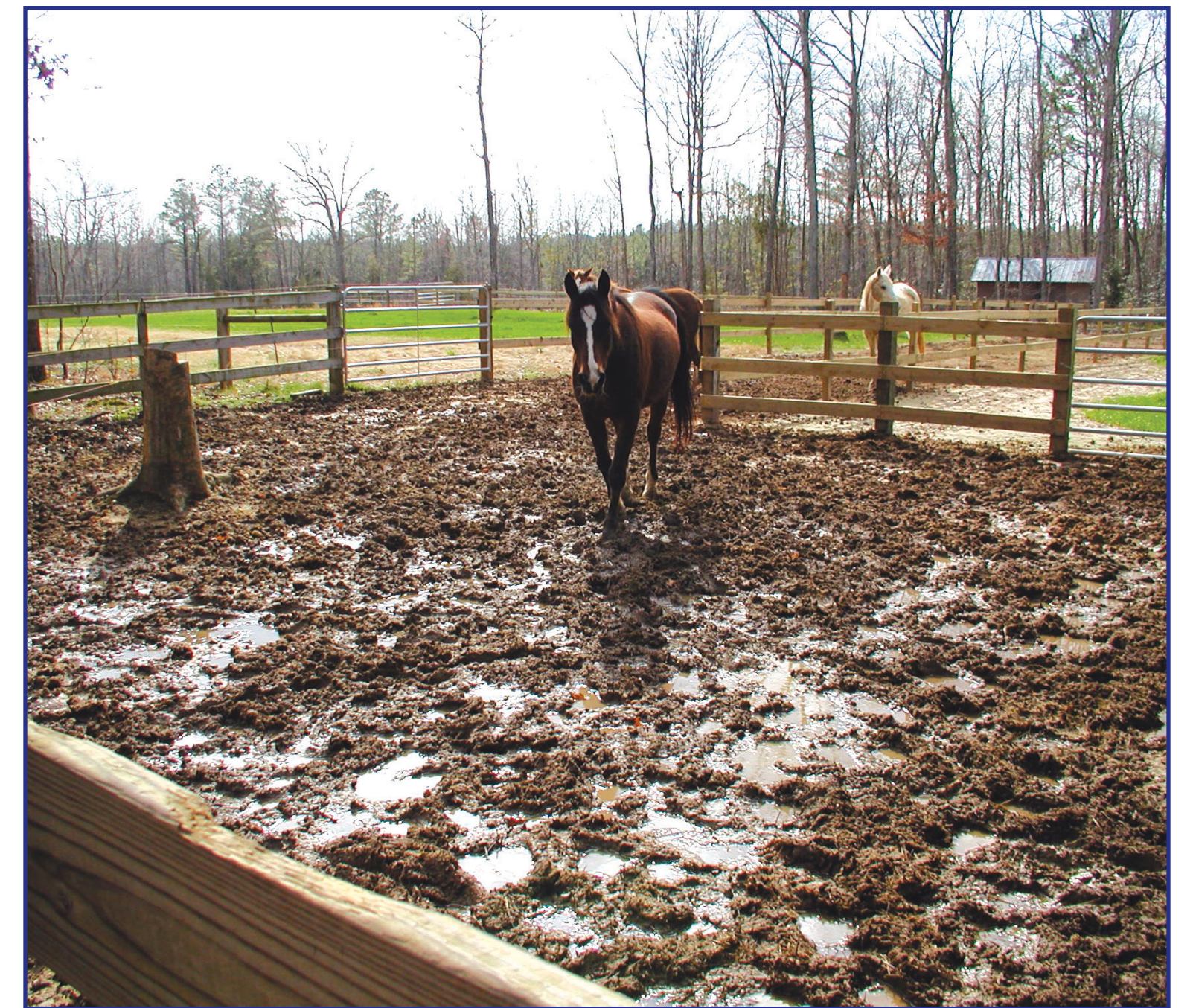
Sacrifice areas often become muddy and require the construction of a rock pad.