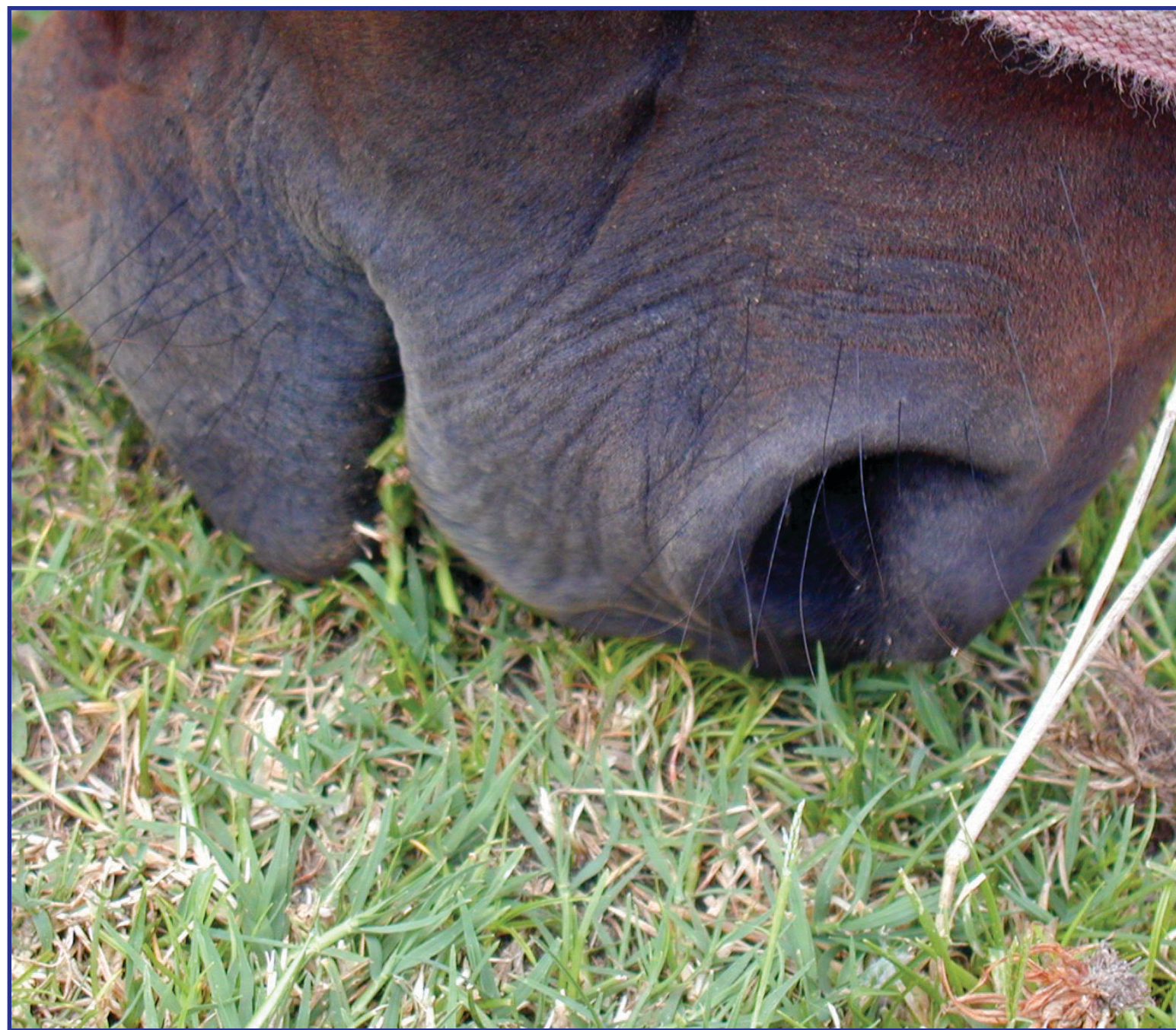
Horses can graze very closely. In this photo a horse grazes a bermudagrass sod too close.