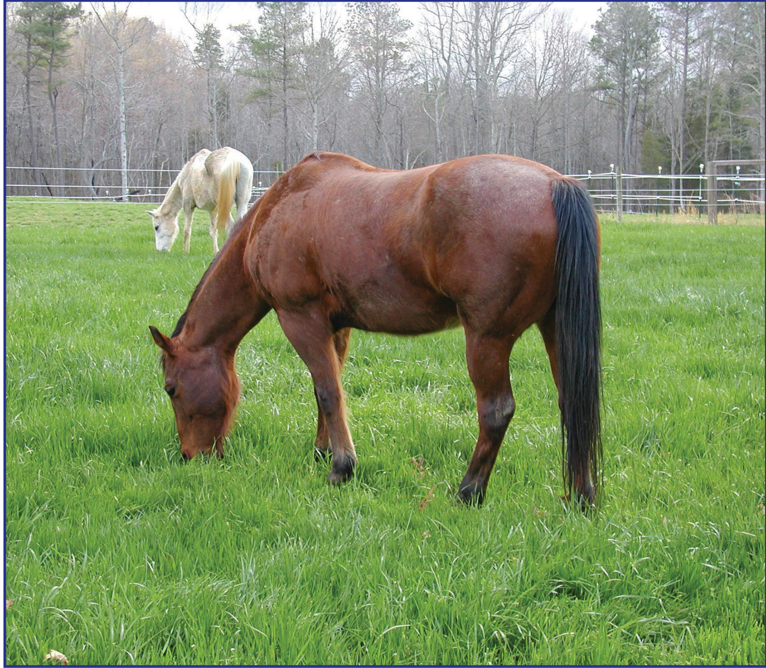
Well-maintained pastures can serve as an economical and high-quality feed source. Here a mature pleasure horse grazes contently in a field of annual ryegrass.