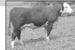
VPI Lady of Class Y102 - Lot 6