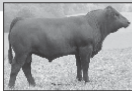
VPI Contrast Z268 - Lot 20