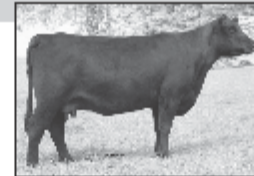
VPI Rita 9W32 - Lot 3