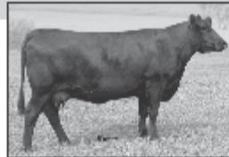
VPI Lady X061 - Lot 9