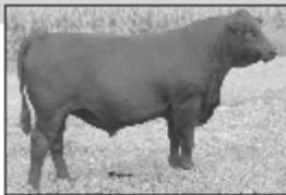
VPI Real Value 2Z28 - Lot 13