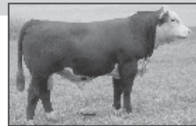
VPI Allas Z212 - Lot 17