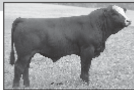
VPI In Time Z270 - Lot 19