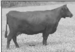
VPI Blackbird 8U3 - Lot 4