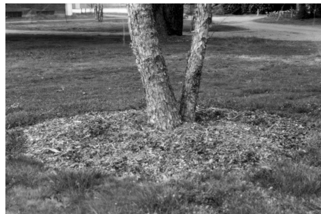
Figure 5. A properly mulched landscape tree.

If allergic reactions may occur, wear a pollen mask while handling organic mulches to avoid inhaling fungal spores that may be present in the mulch.