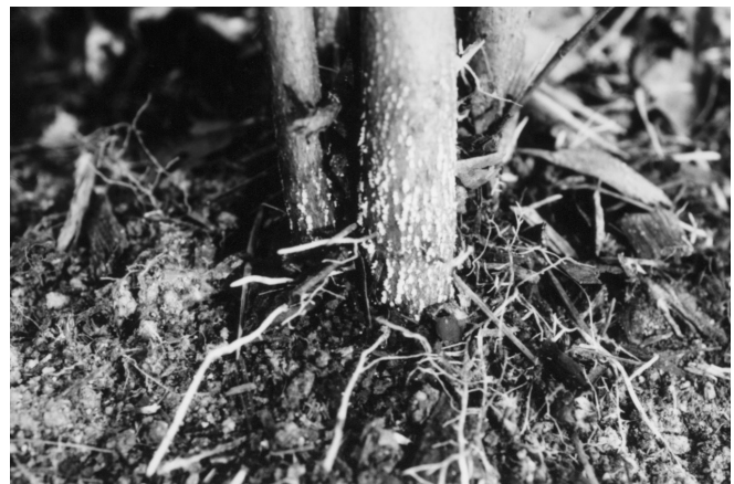
Figure 4. Piling excessive mulch against plant stems can stimulate undesirable shallow rooting in the mulch layer.