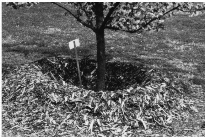
Figure 3. A mulch well can be constructed at planting time to help hold water over the rootball of the tree, but the height of this well is excessive.

Apply loose and sheet mulches at planting time. To prepare an area to be mulched, remove perennial weeds and level the area. Soil should be moist but not wet. Around young trees, extend the mulch from near the trunk out at least to the drip line (the ground area below the tree canopy (Figure 3.)). Established lawn trees will benefit from a mulched area extending 2'-3' out from the trunk. In all cases, keep the area adjacent to the trunk free of mulch to help prevent damage to the tree trunk from excess moisture, insects and diseases, and voles and other pests. Excessive mulching can also stimulate undesirable shallow rooting (Figure 4.). If herbicides will be used in combination with mulches for enhanced weed control, apply the mulch first, then the herbicide over the mulch.