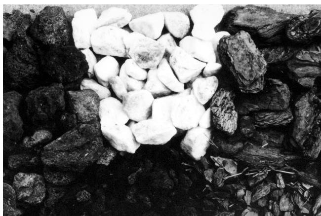
Figure 1. Loose mulch materials can be organic and inorganic, and of small or large particle size. Match the mulch type and size to the landscape situation.

Chip and sawdust mulches from some woods, such as walnut and cedar, produce phytotoxic (plant-killing) chemicals and should be avoided. This toxicity phenomenon is called allelopathy.