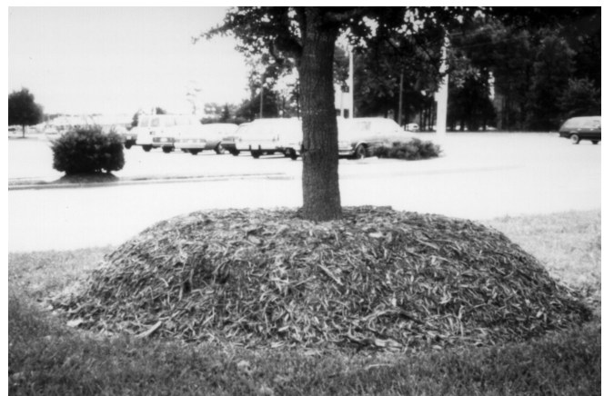
Figure 6. An improperly mulched tree. Bark layer too thick and piled up against the stem.