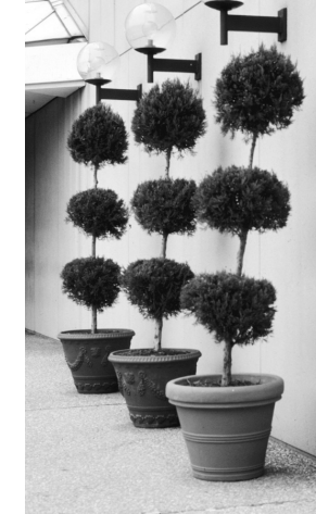
Small trees (topiaried junipers) and containers were used in this exposed area to permit easy relocation to a more protected area during the winter.

Even with careful container and tree selection, trees may outgrow the volume of their containers. Periodic tree removal for root pruning and substrate replacement is one method of