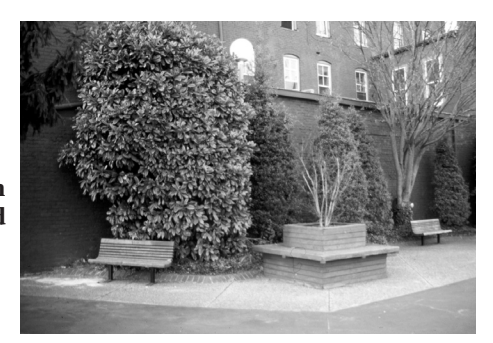
Planter built of material to coordinate with the background wall.

With regard to container or planter size, a confined tree root system ideally should have two cubic feet of substrate for every square foot of tree canopy. Consider the mature size of the desired tree and design or select containers or planters with adequate root volume. Remember that the greater the substrate volume in the container or planter, the greater the temperature buffering, and the reserve of water and nutrients. In exposed and windy areas it may be desirable to line containers and planters with supplemental insulation.