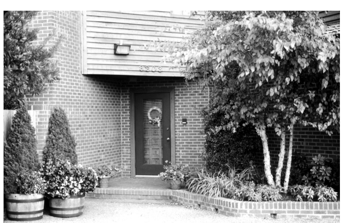
Trees can be planted in both moveable containers (left – dwarf Alberta spruce) and in permanent planters (right – river birch).

Planting trees in aboveground containers and planters is becoming a common practice on sites that are not suited for inground planting. Containers differ from raised planters in that they are usually smaller in volume and moveable, whereas planters are generally larger, and often built as part of the permanent hardscape (paving, etc.). The greatest challenge in selecting trees for containers and planters is in choosing trees that can survive temperature extremes, and that can establish roots in a limited volume of substrate (potting soil). Consider several factors when selecting containers and trees including environmental influences, container and planter design, substrate type, and tree characteristics.