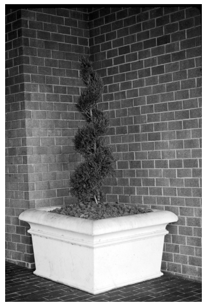
Container used in a sheltered location to protect the tree from temperature extremes and wind (topiaried juniper).

Tree roots in containers and planters may die during the summer