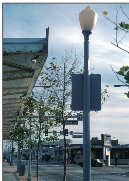
Top: Trees and shrubs "salt burned" on the windward side.