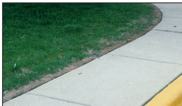
Turf along the sidewalk edge has been killed back by de-icing salts.