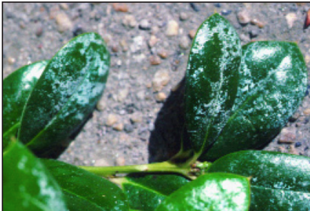
Salt deposits on a holly leaf after the water has evaporated.

Examine injury patterns on trees and shrubs. Winter salt spray damage to deciduous plants causes bud death and twig dieback. Tree and shrub growth after this damage will have a "witches-broom" (tufted) appear