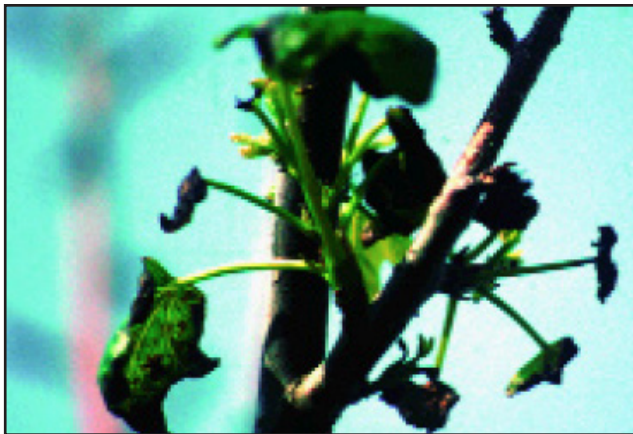
Salt spray damage on new sweetgum leaves.