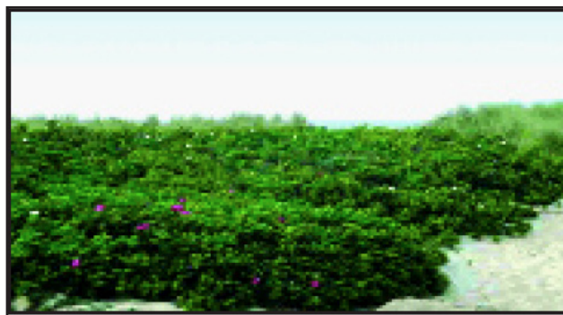
Salt tolerant shrub – Rugose rose.