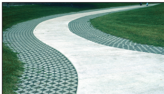
To reduce de-icing salt damage, open pavers have replaced turf along the sidewalk edge.