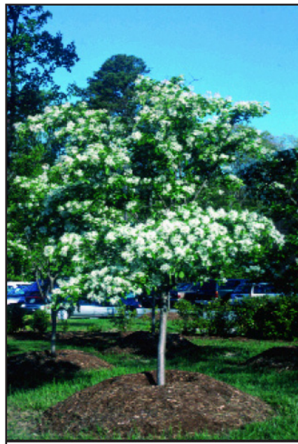
Salt tolerant tree – Chinese fringetree.