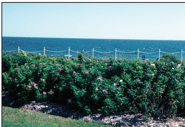
Salt tolerant rugose roses in a park bordering the Chesapeake Bay.