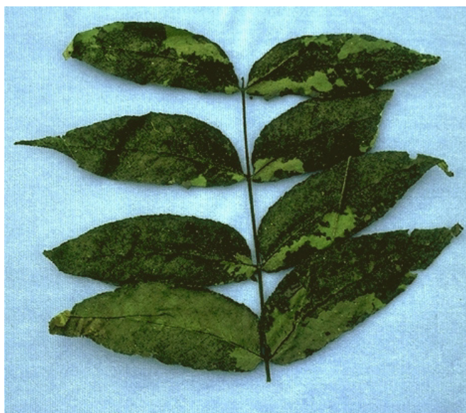
Fig. 1. Sooty mold on walnut.

The presence of a black, soot-like fungus, frequently appearing as a thin crust over the surface of leaves, is the best indicator of this problem (Fig. 1). However, some species of sooty molds grow as a thick, spongy mass that encases the needles of conifers or the twigs of deciduous trees (Figs. 2 and 3). Insect activity may or may not be apparent. Sooty molds may persist long after the insects themselves have disappeared. Although sooty molds do not directly infect plants, severely affected plants may be yellowed and suffer defoliation from the combined effects of insect feeding and the reduction in photosynthesis that results from blockage of sunlight by the fungus. Although sooty mold usually does not cause dieback or mortality, the insect feeding that preceded the sooty mold infestation may be severe enough to weaken or kill portions of infested plants. Pruning out dead and dying branches helps prevent infection by secondary pathogens.