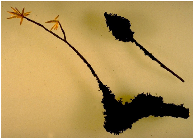
Fig. 2. Thick, crusty growth of sooty mold on beech.